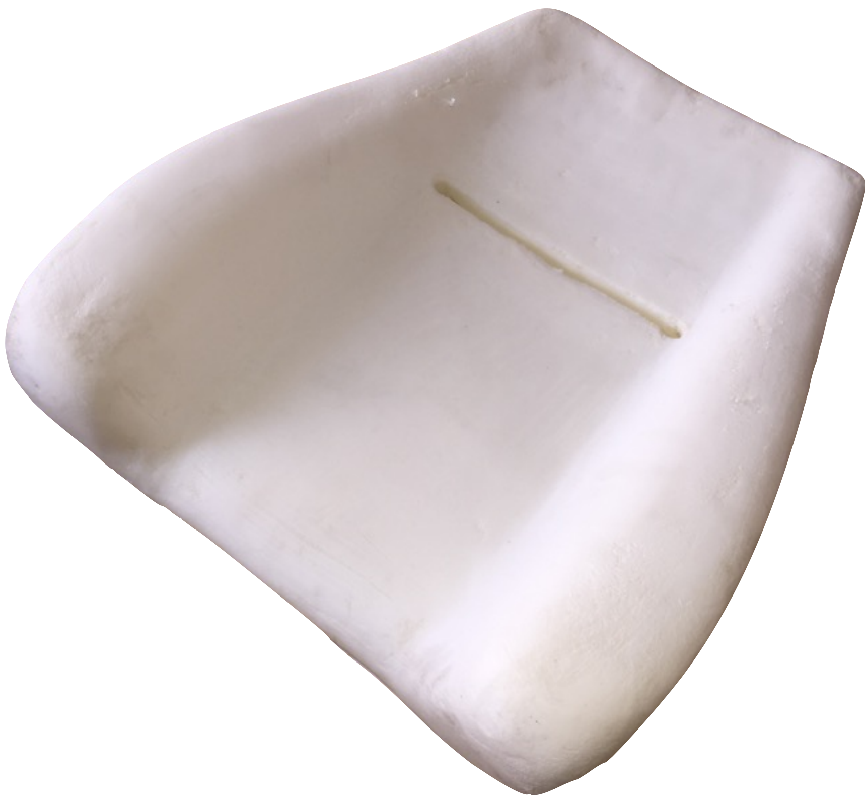
OB23 Replacement Back Foam for RENAULT 9