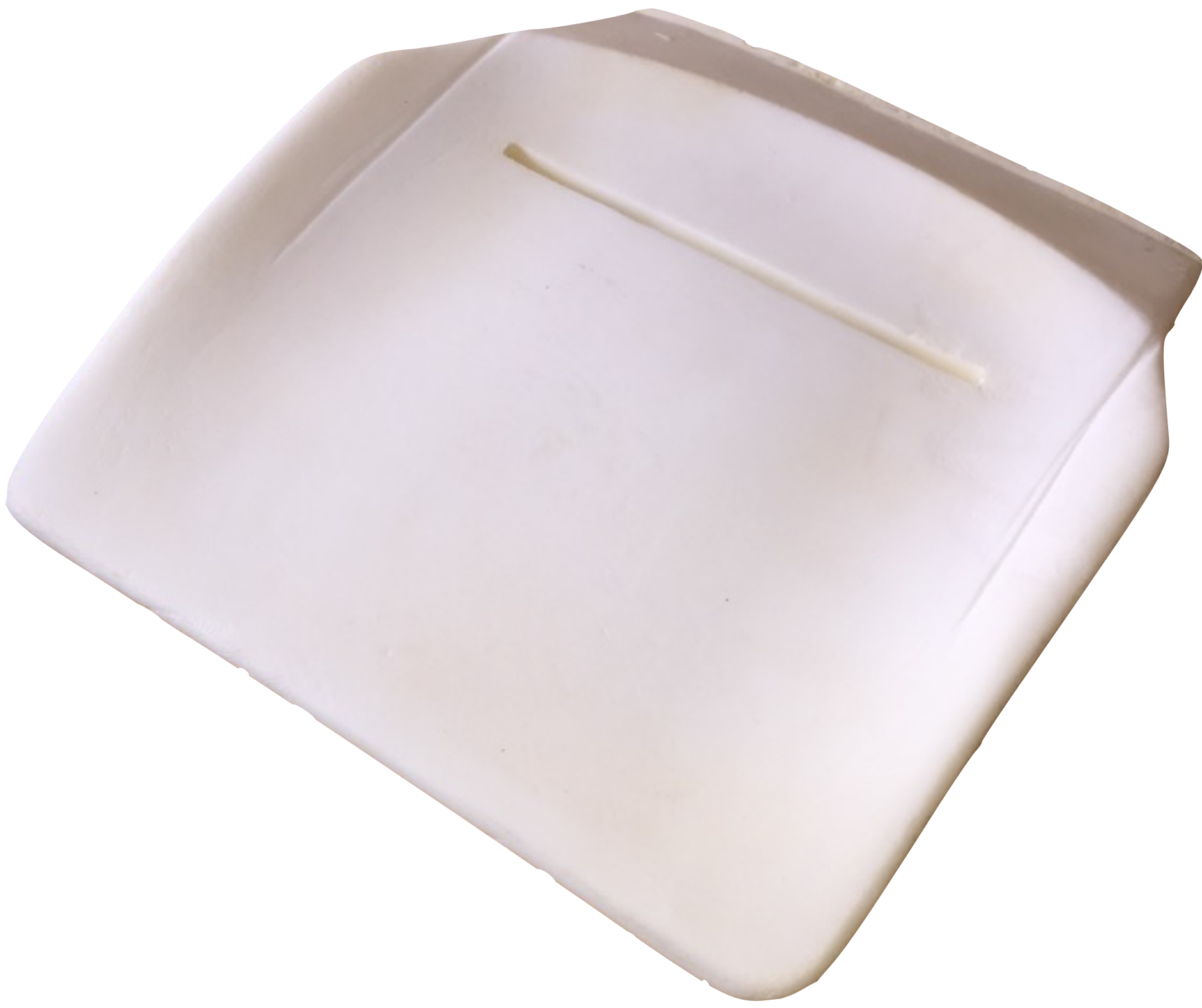
OB06 Replacement Bottom Foam