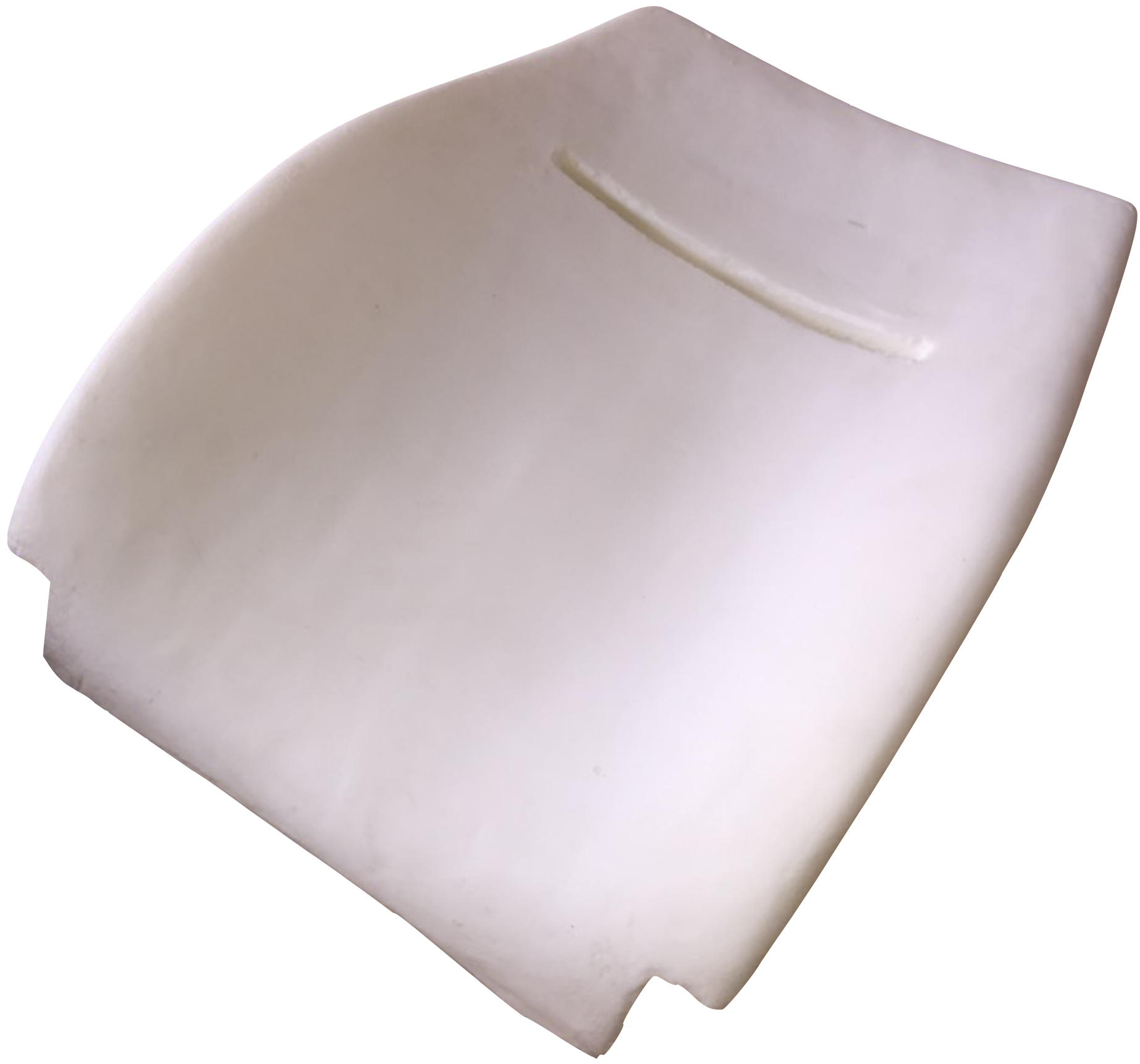
OB09 Replacement High Backrest Foam