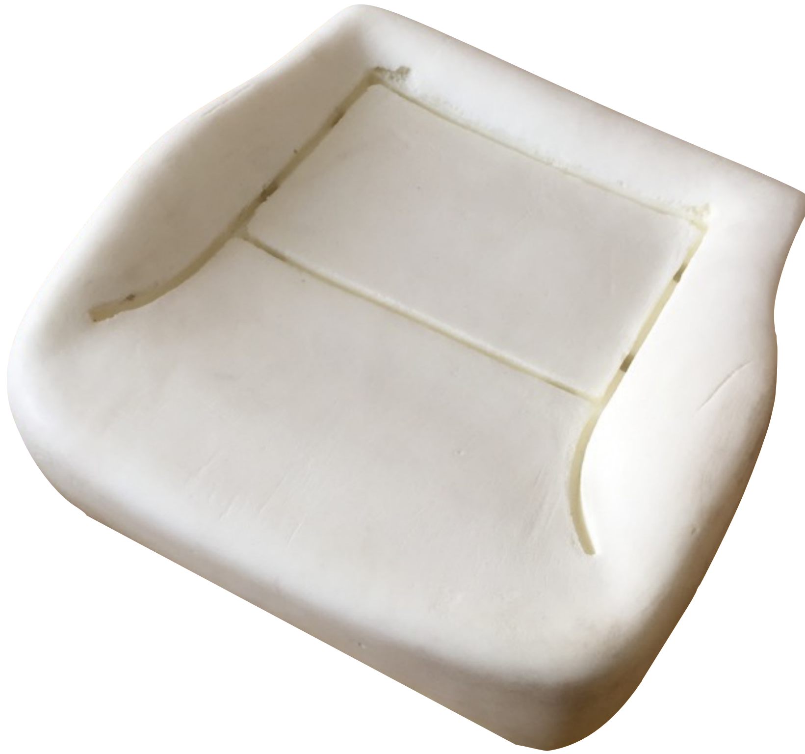
OB37 Replacement Bottom Foam for HYUNDAI H-100