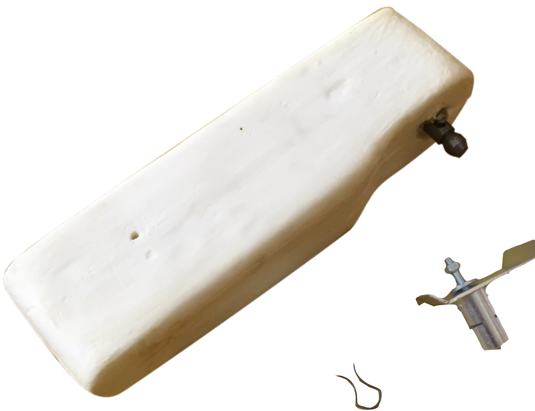
OB03 10cm Tick Armrest Foam for Driver Seat