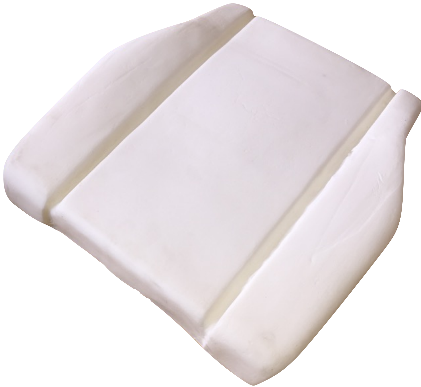
OB36 Replacement Bottom Foam for MERCEDES AXOR