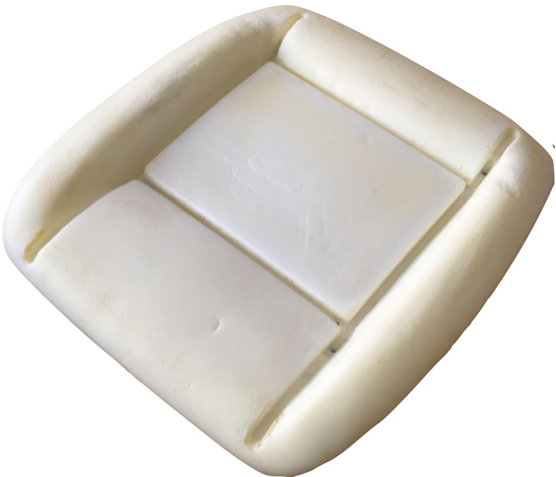
OB75 Replacement Bottom Foam for VOLKSWAGEN TRANSPORTER T5/T6