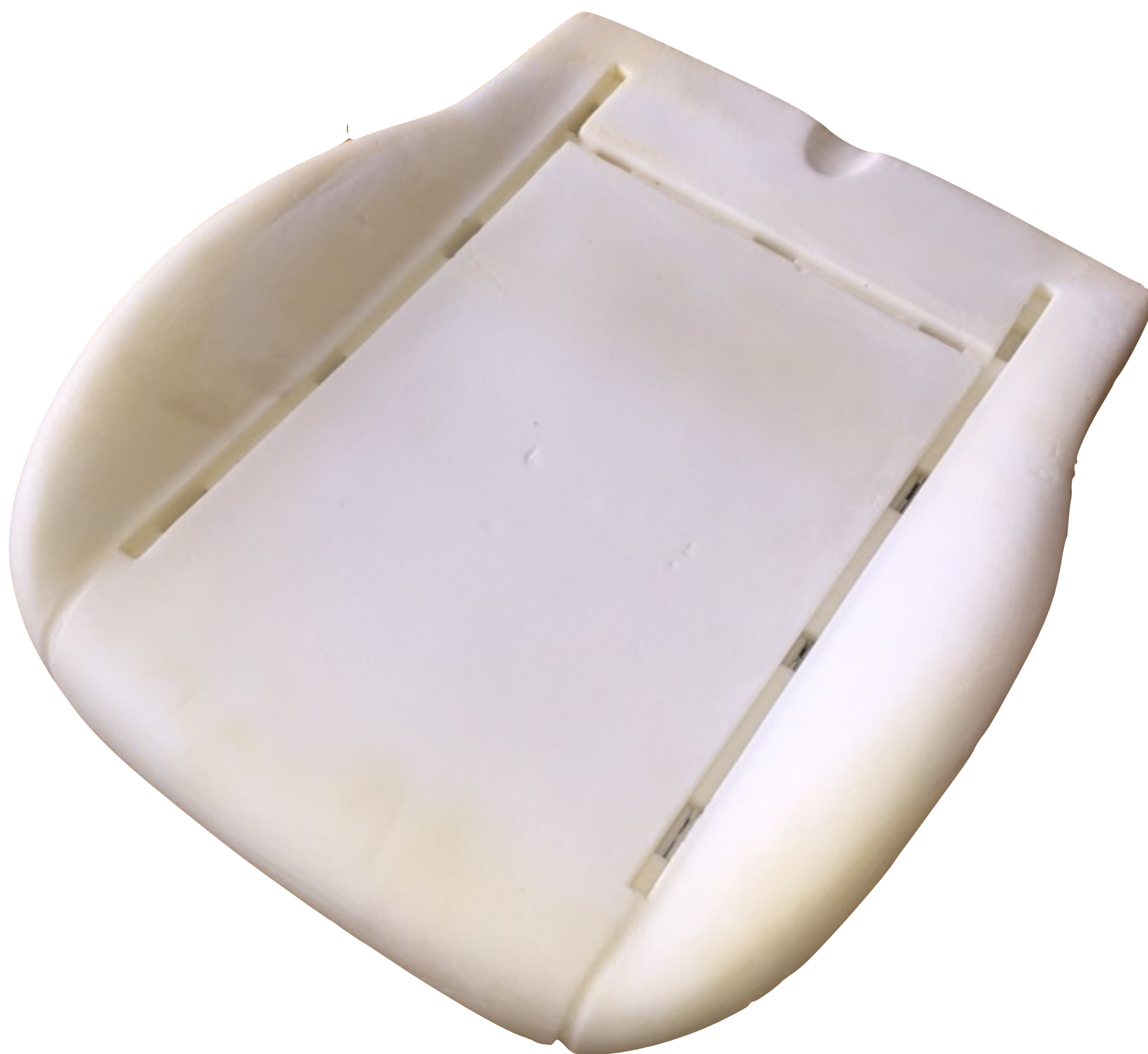
OB39 Replacement Bottom Foam for HYUNDAI ERA