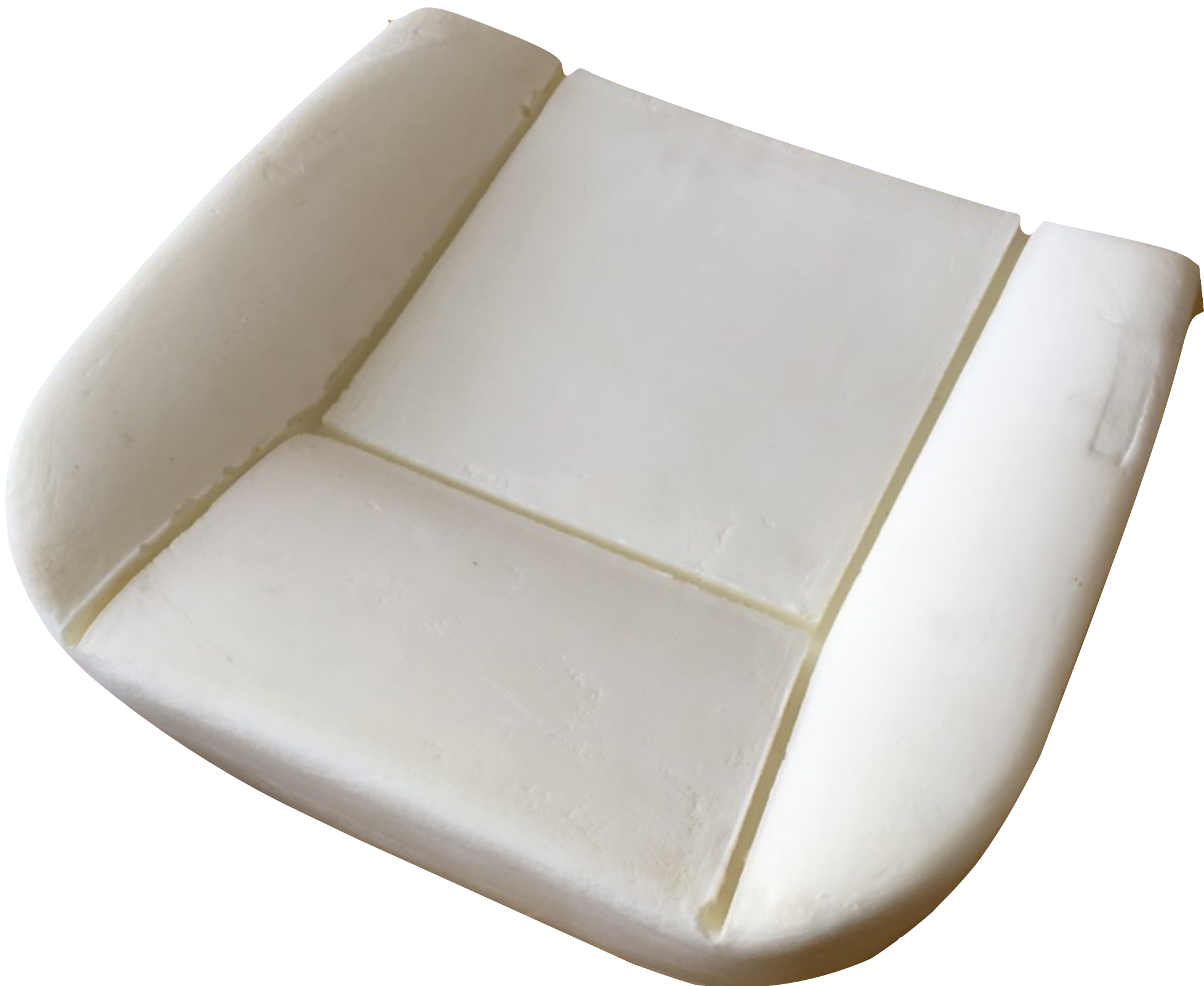
OB19 Replacement Bottom Foam for ŞAHİN