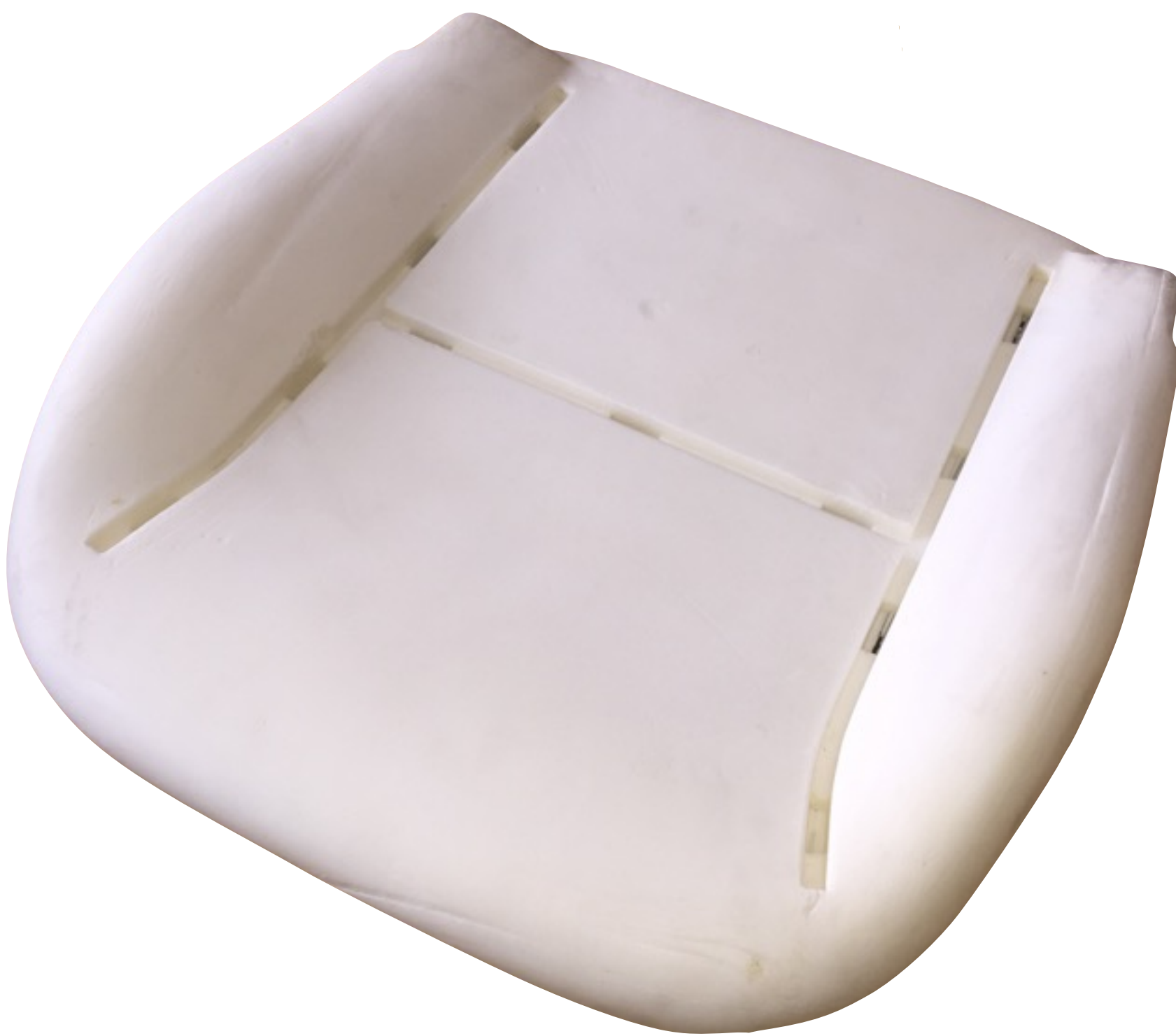
OB38 Replacement Bottom Foam for PEUGEOT PARTNER