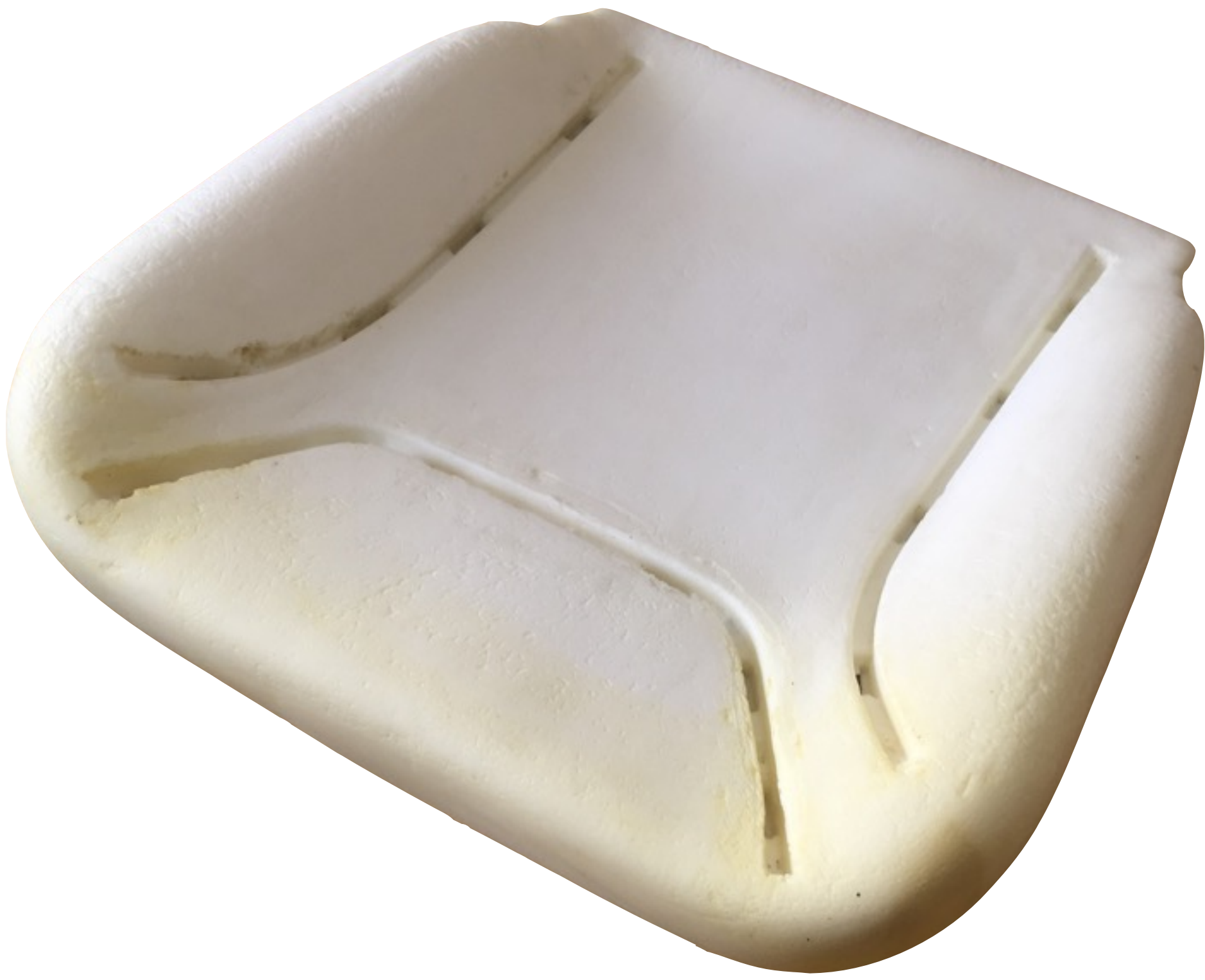
OB92 Replacement Bottom Foam for RENAULT TRAFIC / OPEL VIVARO