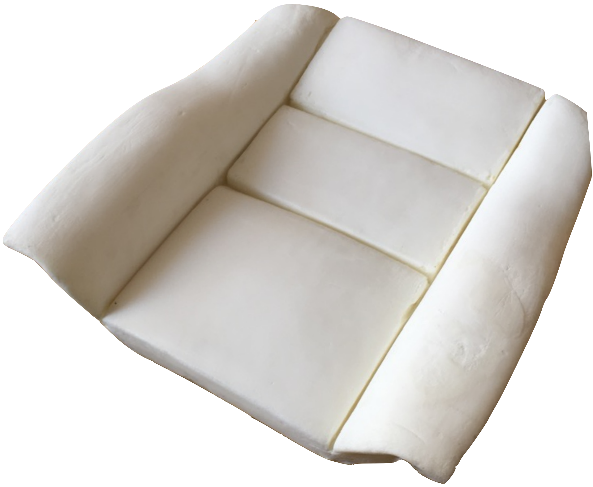
OB25 Replacement Backrest Foam - RENAULT 19