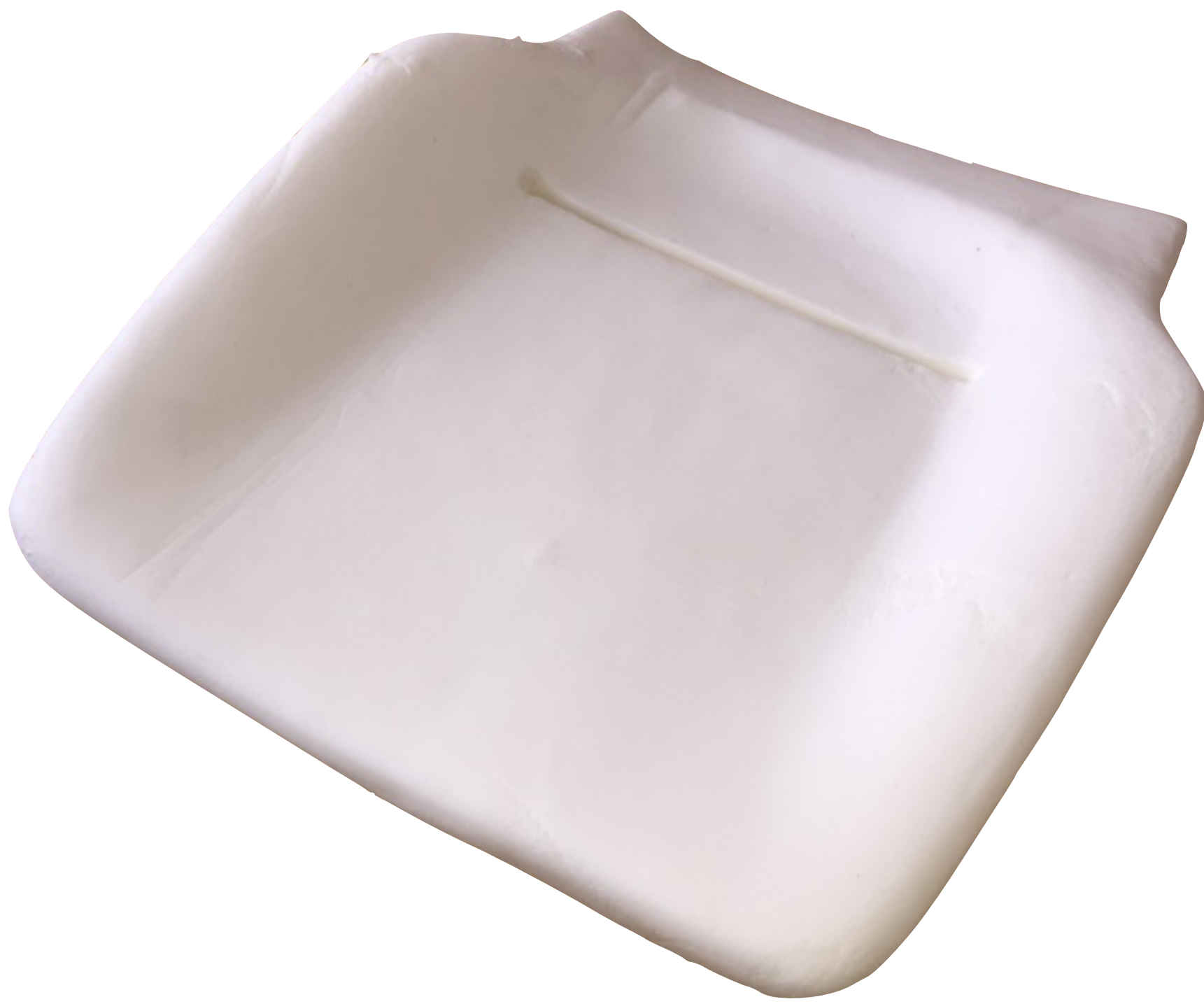
OB15 Replacement Bottom Foam for IVECO CANTER