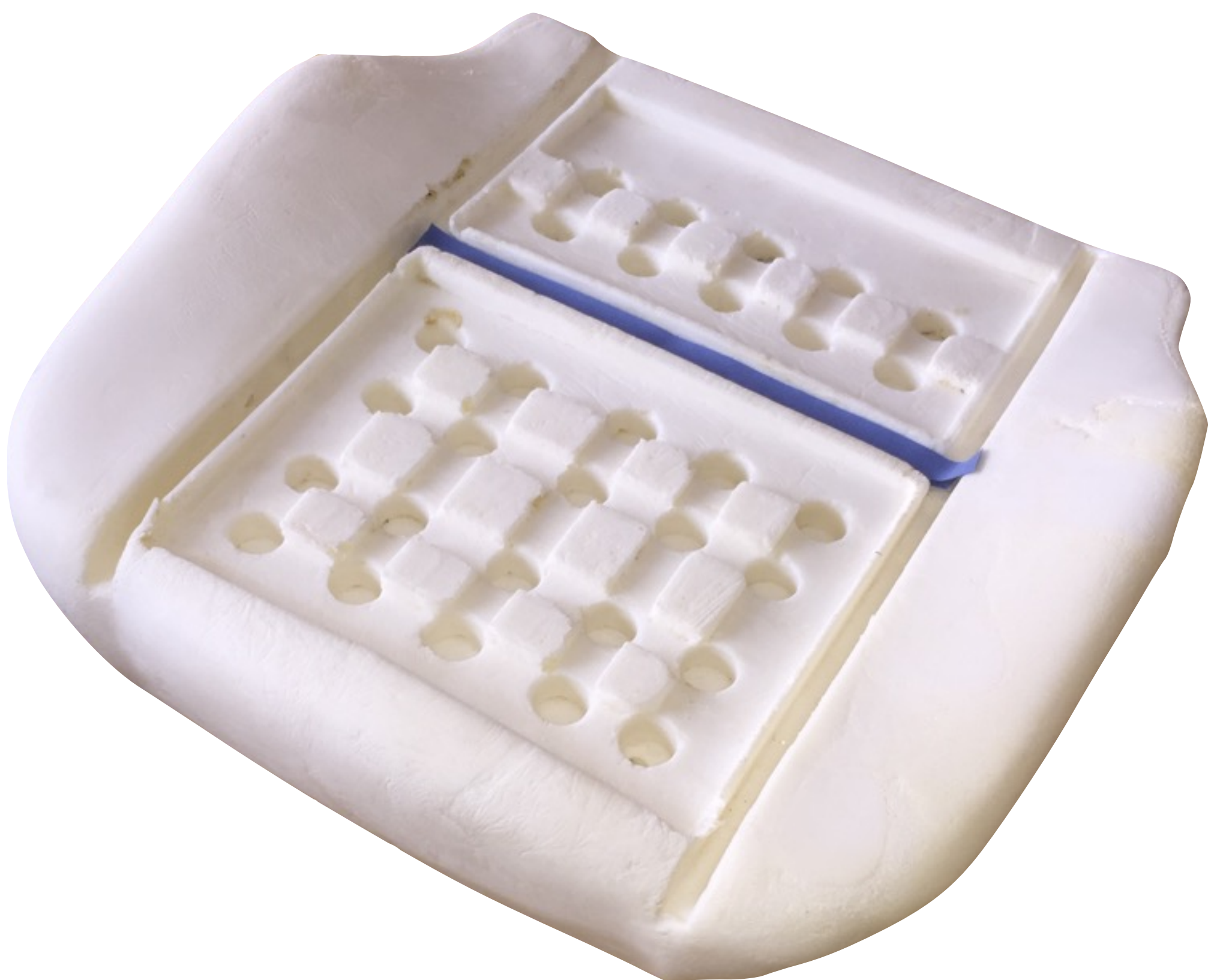
OB76 Replacement Bottom Foam for MERCEDES SPLINTER / VOLKSWAGEN CRAFTER