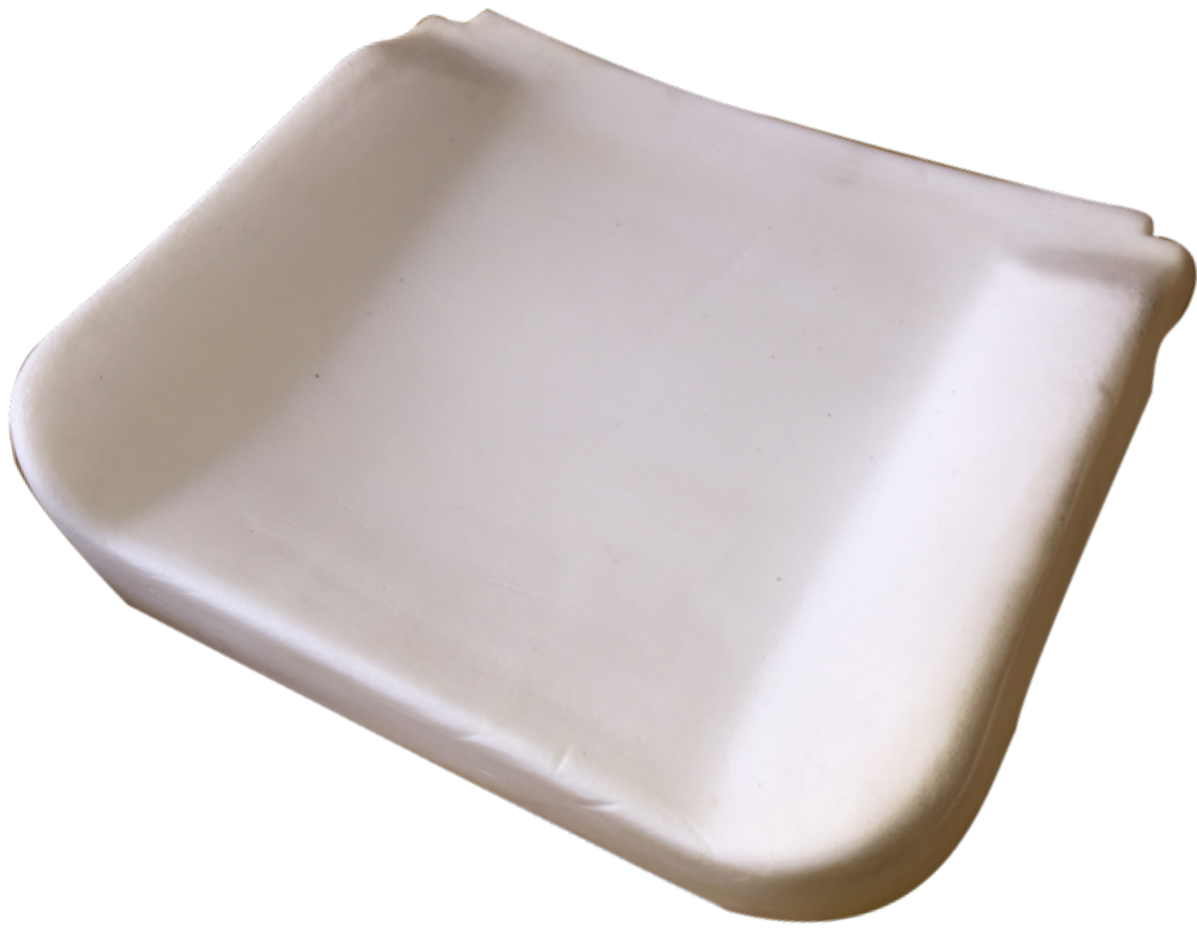
OB21 Replacement Bottom Foam for RENAULT 12