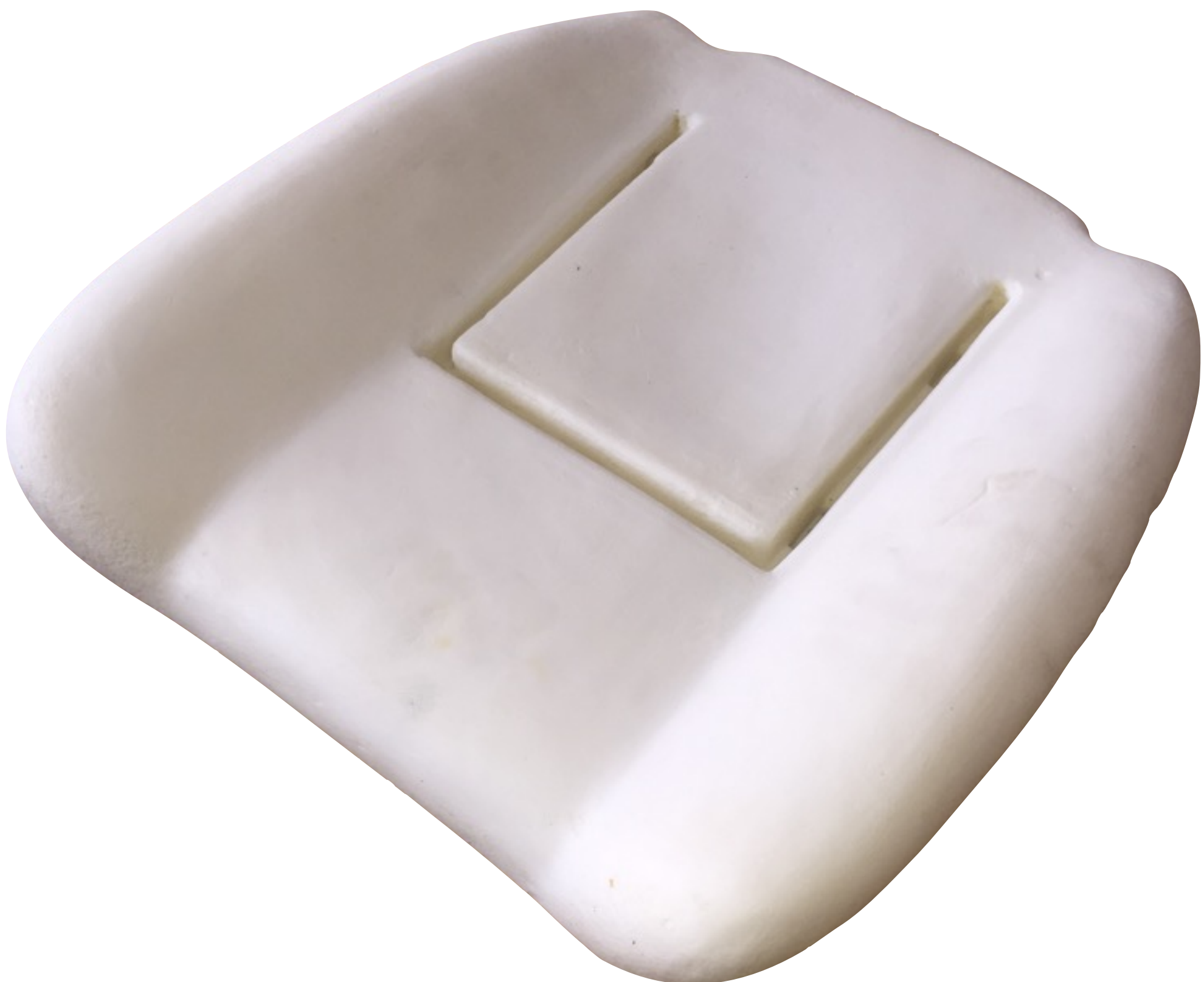
OB22 Replacement Bottom Foam for RENAULT 9