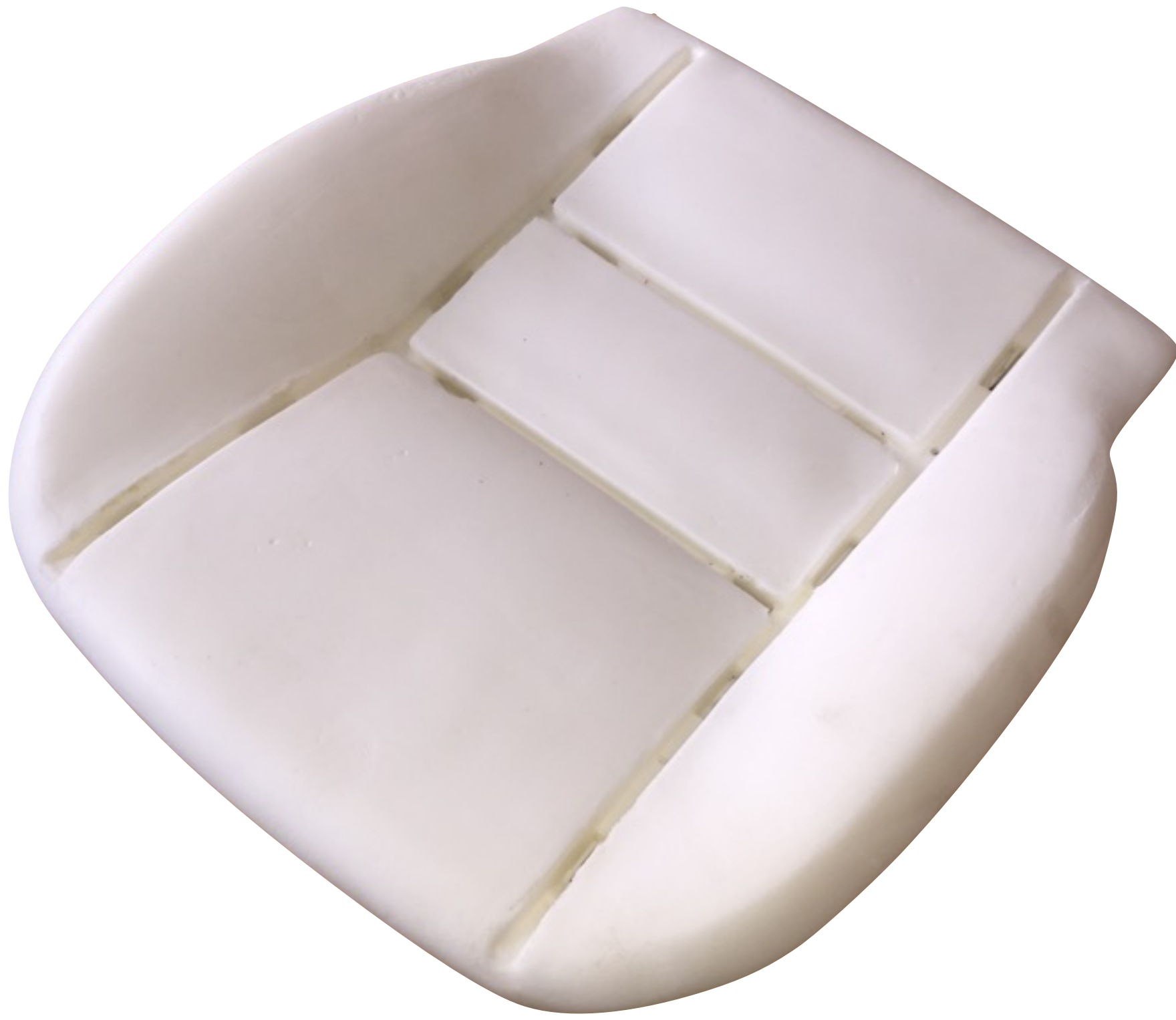
OB77 Replacement Bottom Foam for CITROEN JUMPER / FIAT DUCATO / PEUGEOT BOXER