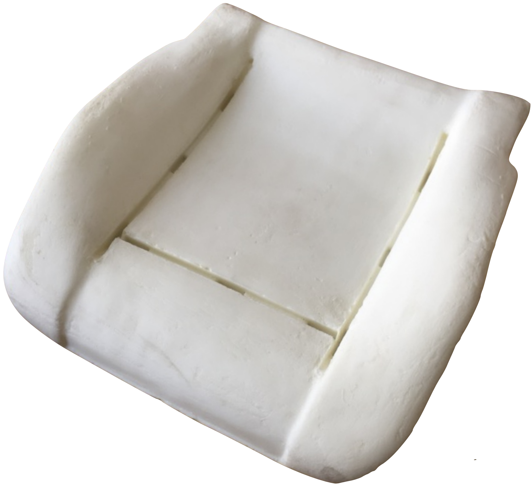
OB31 Replacement Bottom Foam for TEMPRA / TIPO / SLX