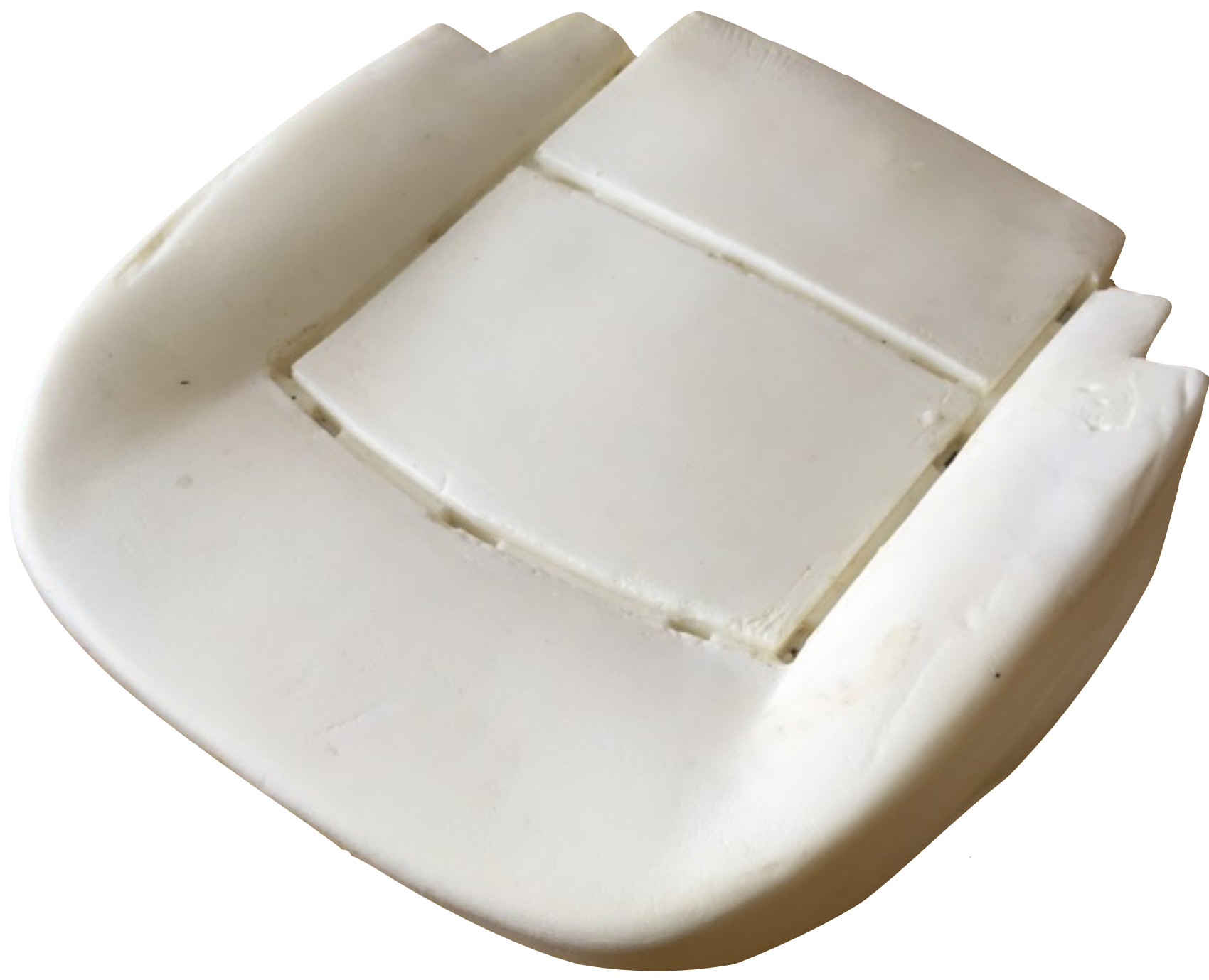
OB47 Replacement Bottom Foam for RENAULT CLIO 4