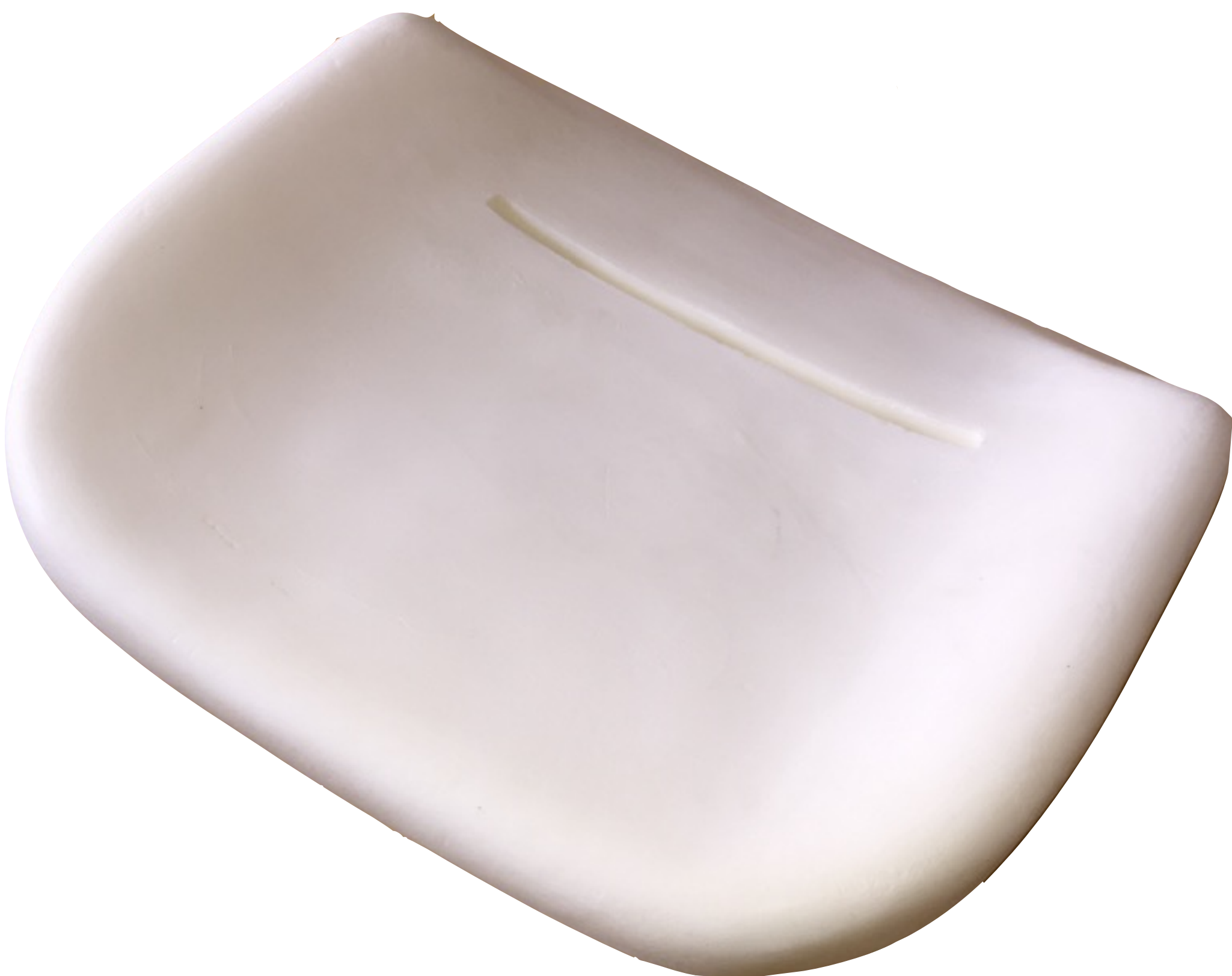
OB18 Replacement Bottom Foam for FORD TRANSIT