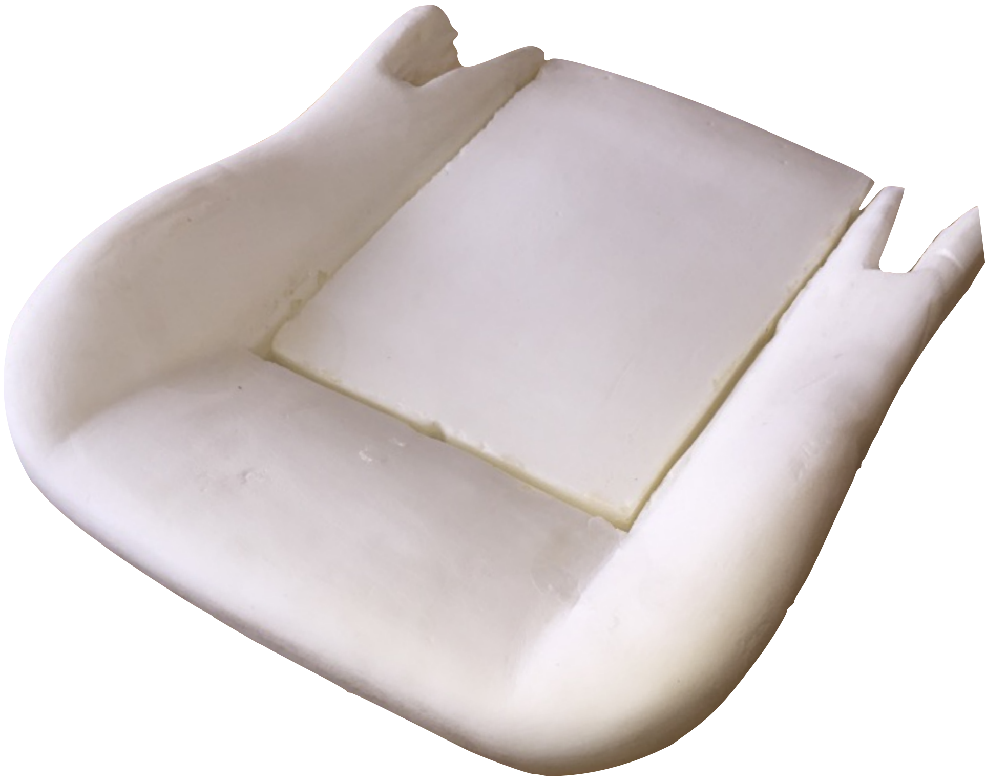
OB26 Replacement Bottom Foam for RENAULT MEGAN 1