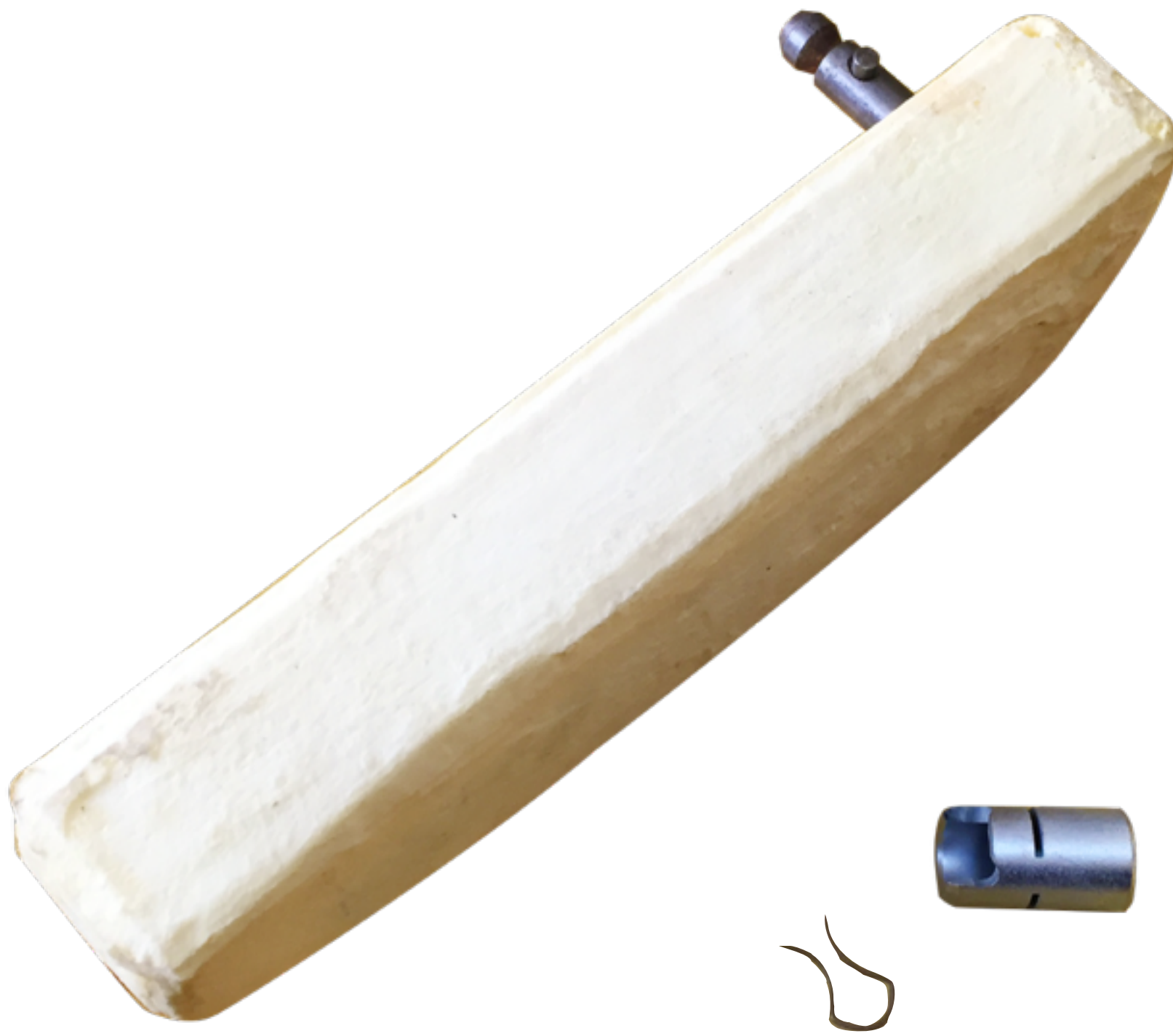
OB04 Thin Armrest Foam for Passenger Seat