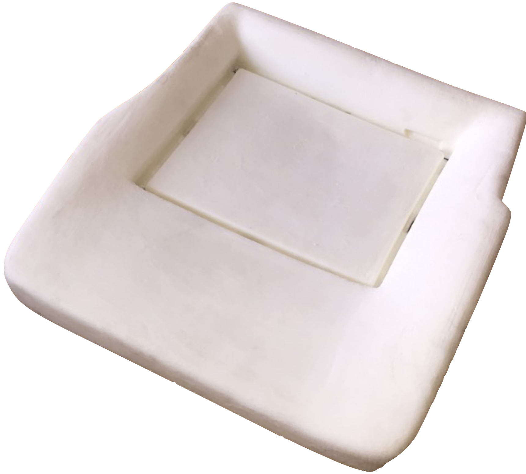
OB13 Replacement Bottom Foam for MITSUBISHI L300