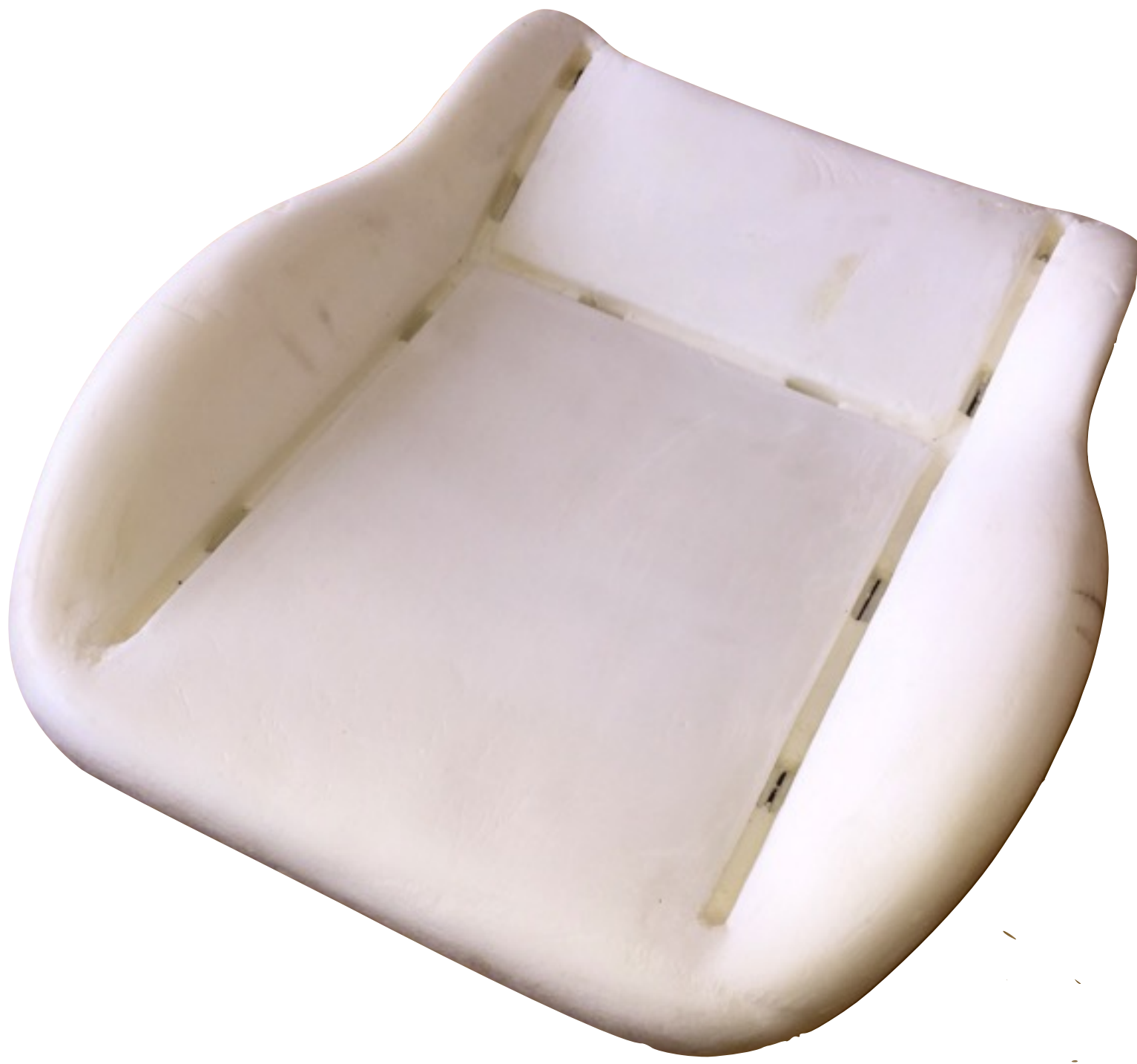
OB78 Replacement Bottom Foam for OPEL COMBO C / CORSA C