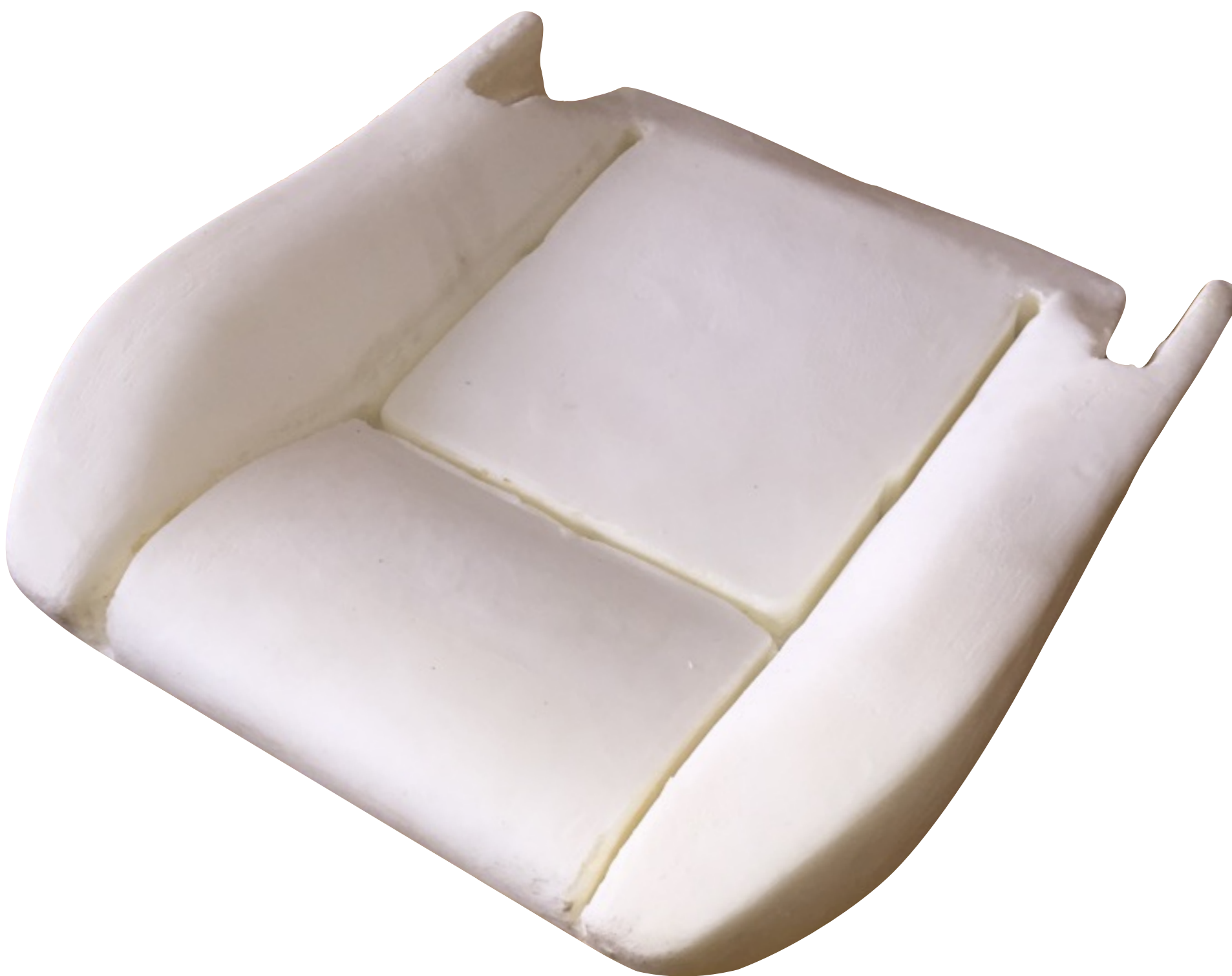
OB24 Replacement Bottom Foam for RENAULT 19