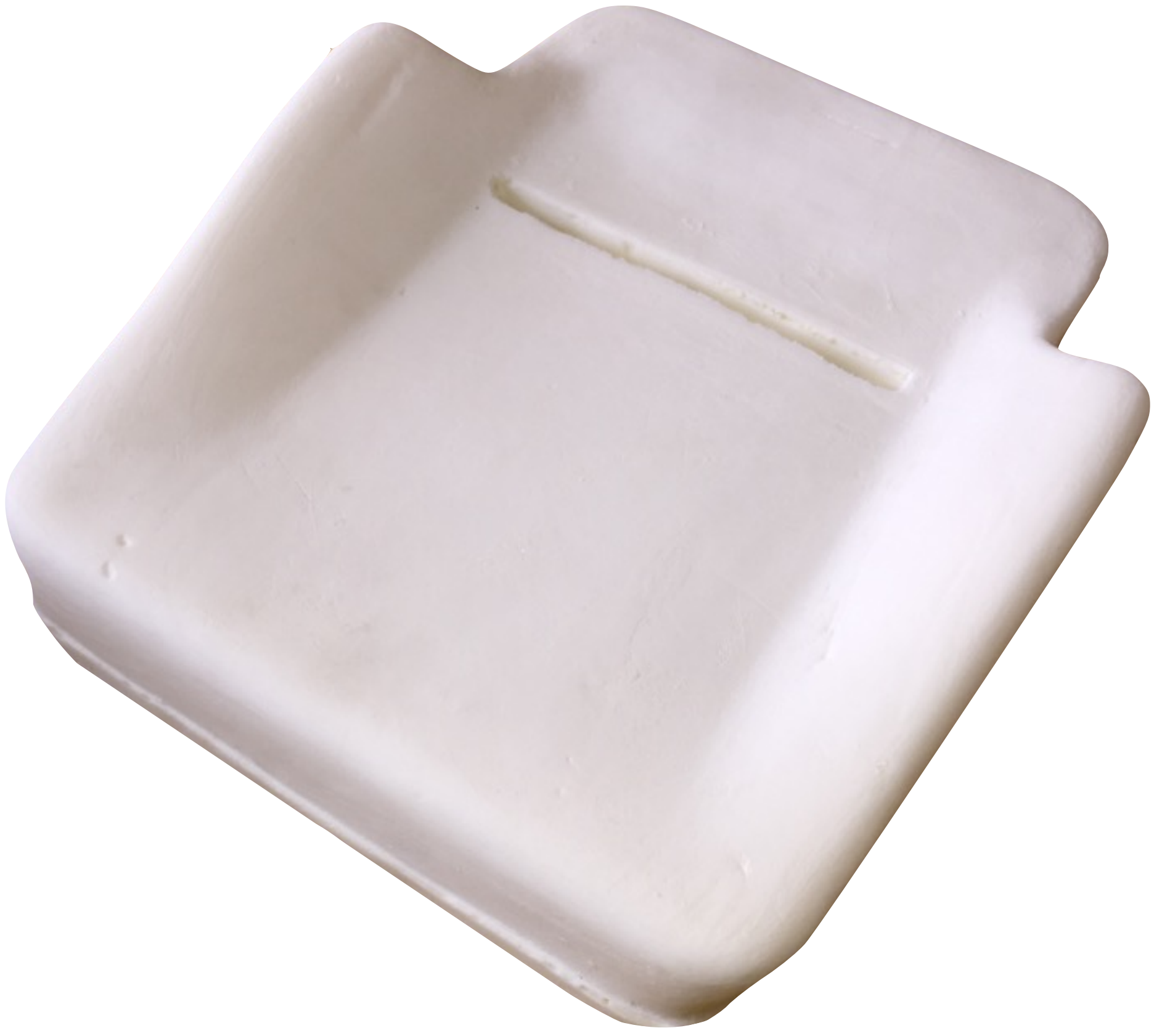
OB08 Replacement Bottom Foam for Air Suspension Car Seat