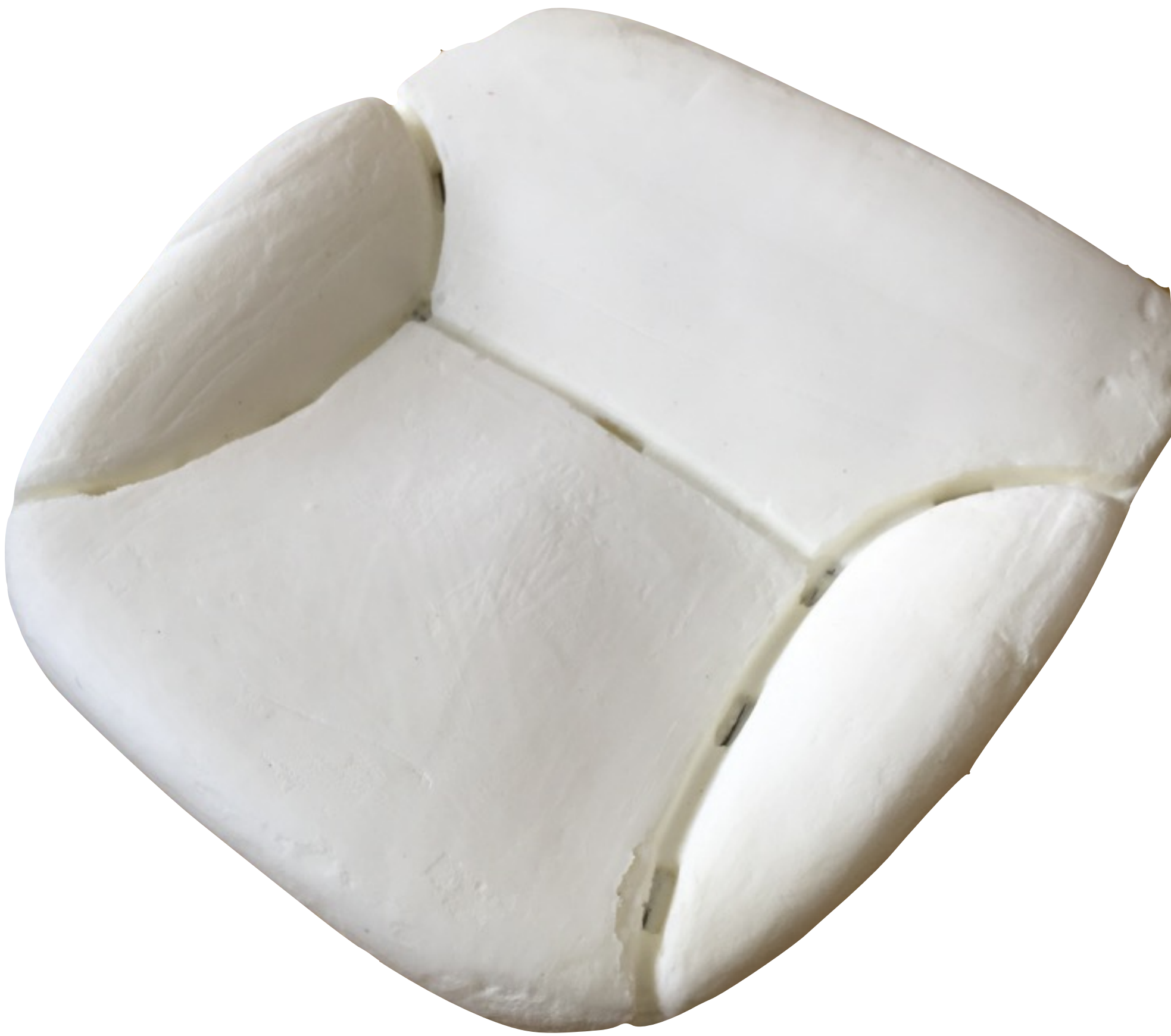
OB28 Replacement Bottom Foam for FIAT ALBEA (OLD BODY)