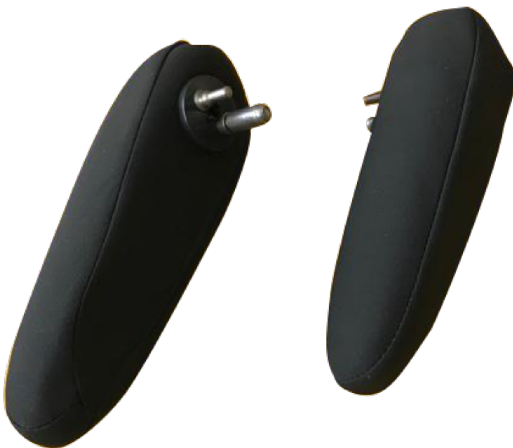
OB78-79 Left and Right Armrest (covered) for PEUGEOT PARTNER