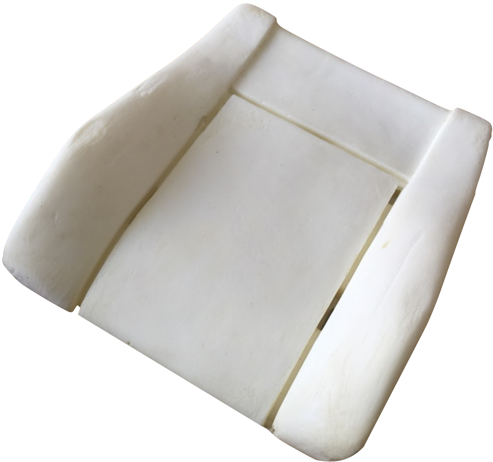
OB32 Driver Side - Driver Side - Replacement High Back Foam TEMPRA / TIPO / SLX