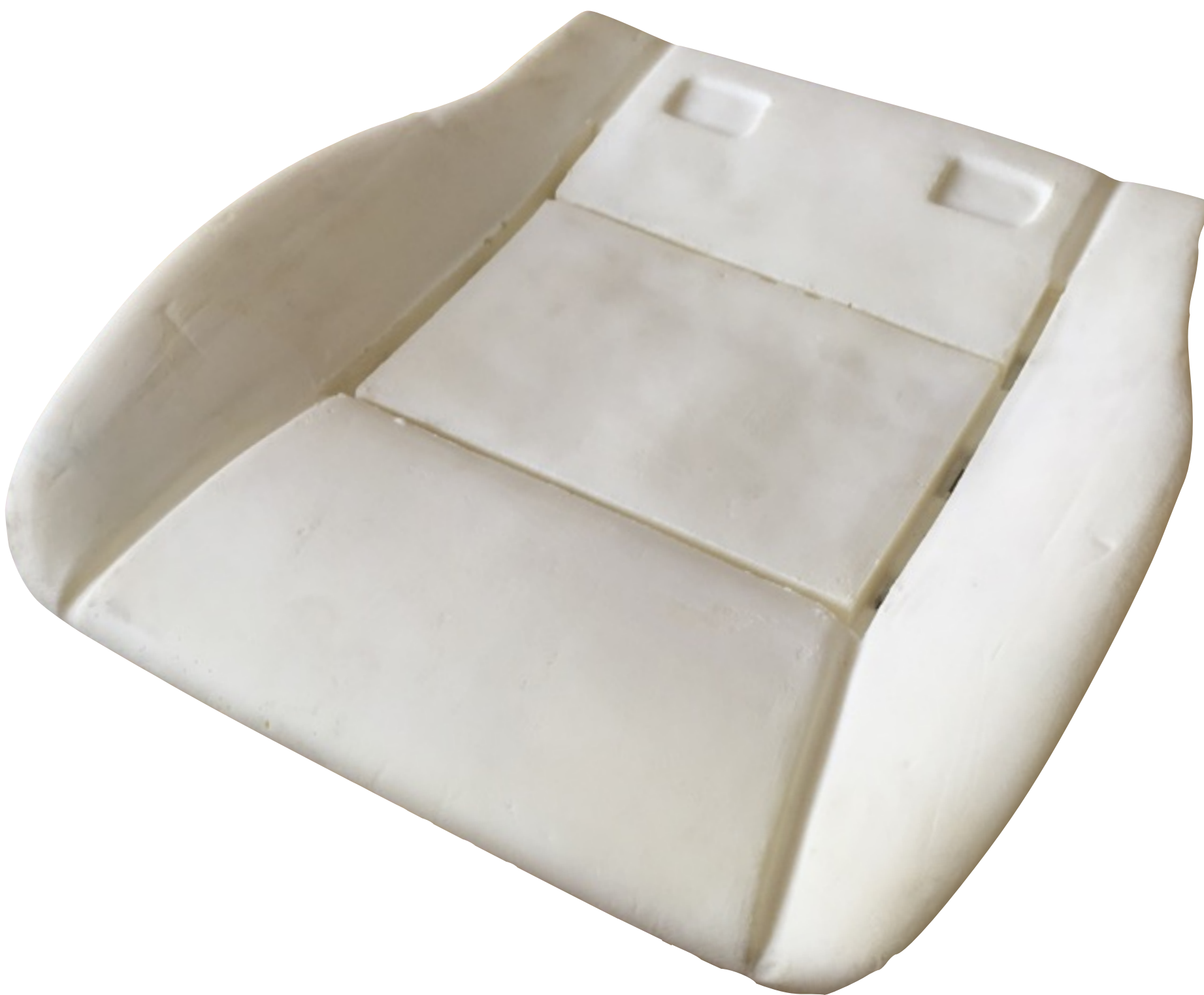
OB35 Replacement Bottom Foam for MITSUBISHI L200 (OLD BODY)