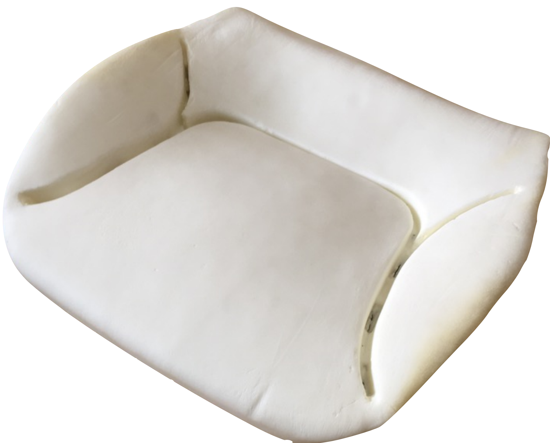
OB29 Replacement Bottom Foam for FIAT DOBLO / ALBEA (NEW BODY)