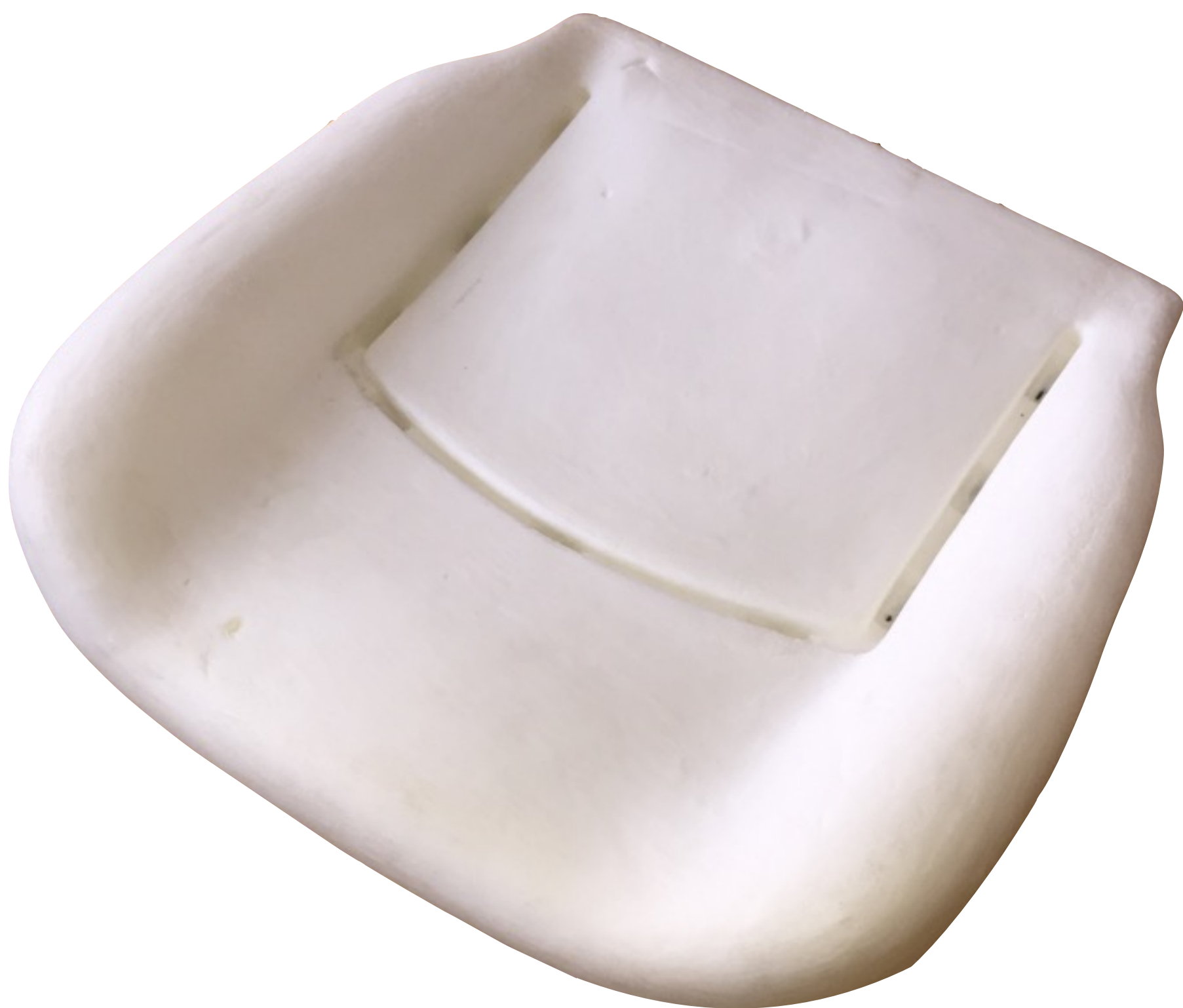
OB27 Replacement Bottom Foam for RENAULT KANGOO