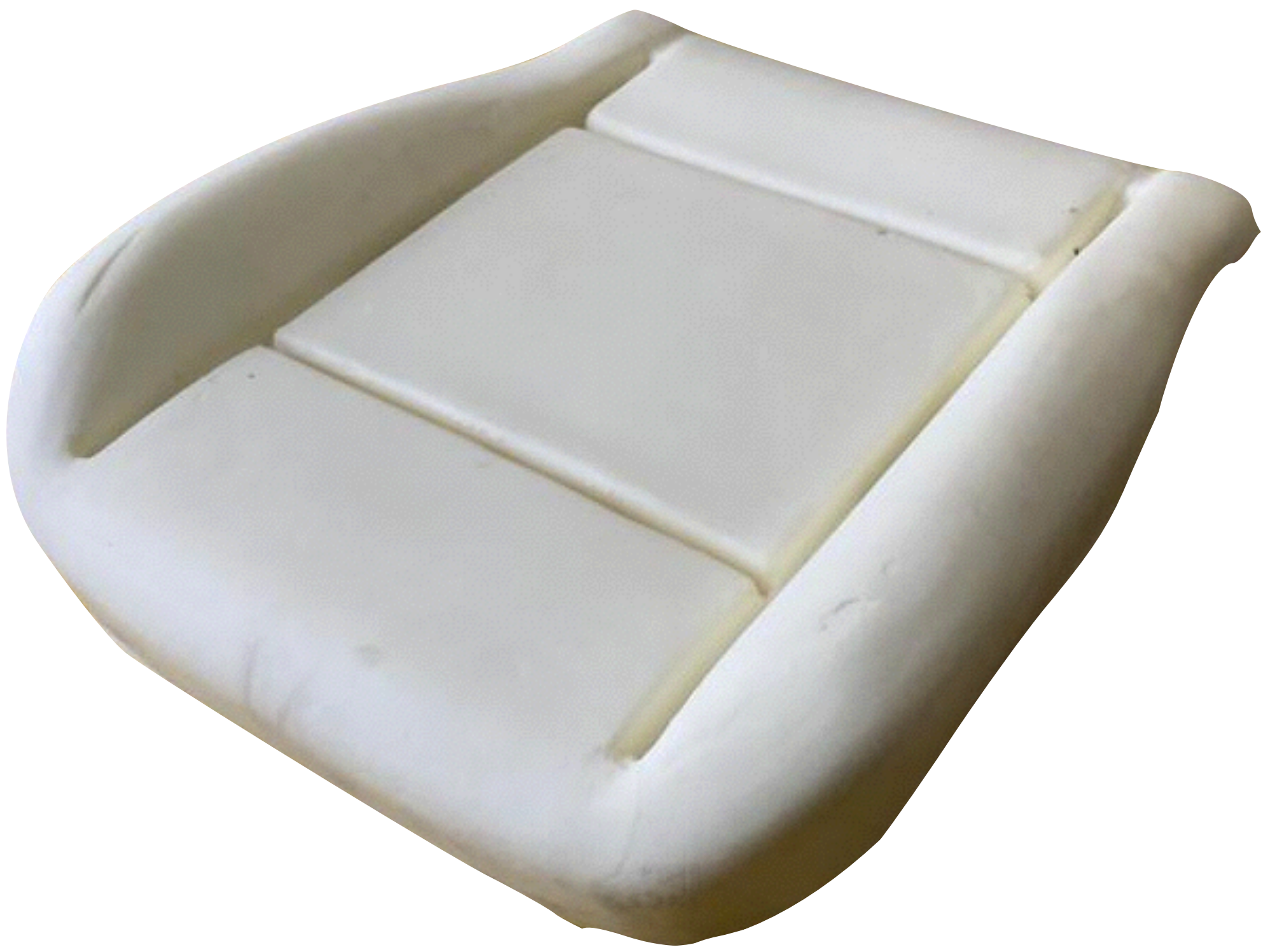
OB116 Replacement Bottom Foam for VALKSWAGEN CADDY