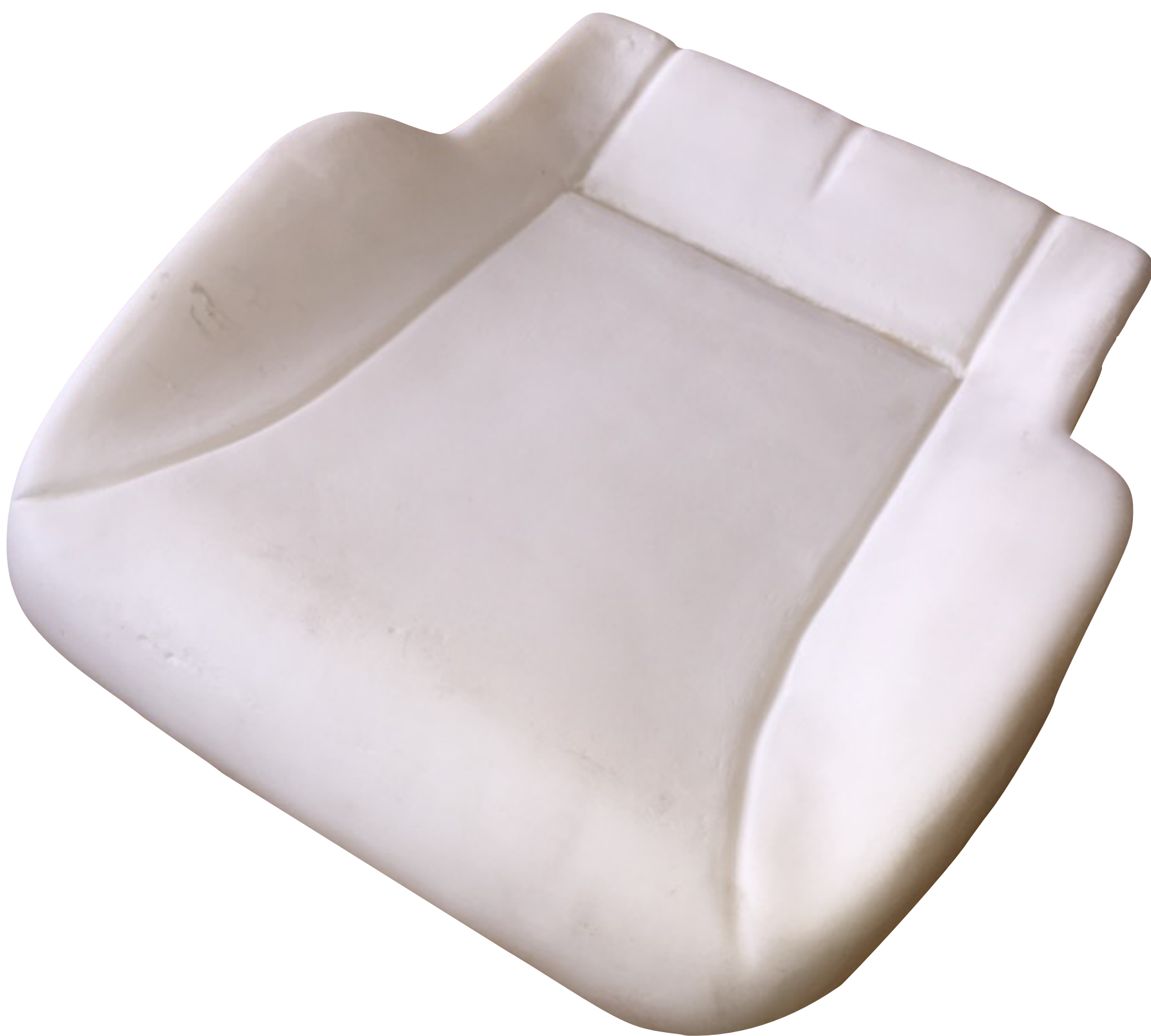
OB17 Replacement Bottom Foam for MAN TGA