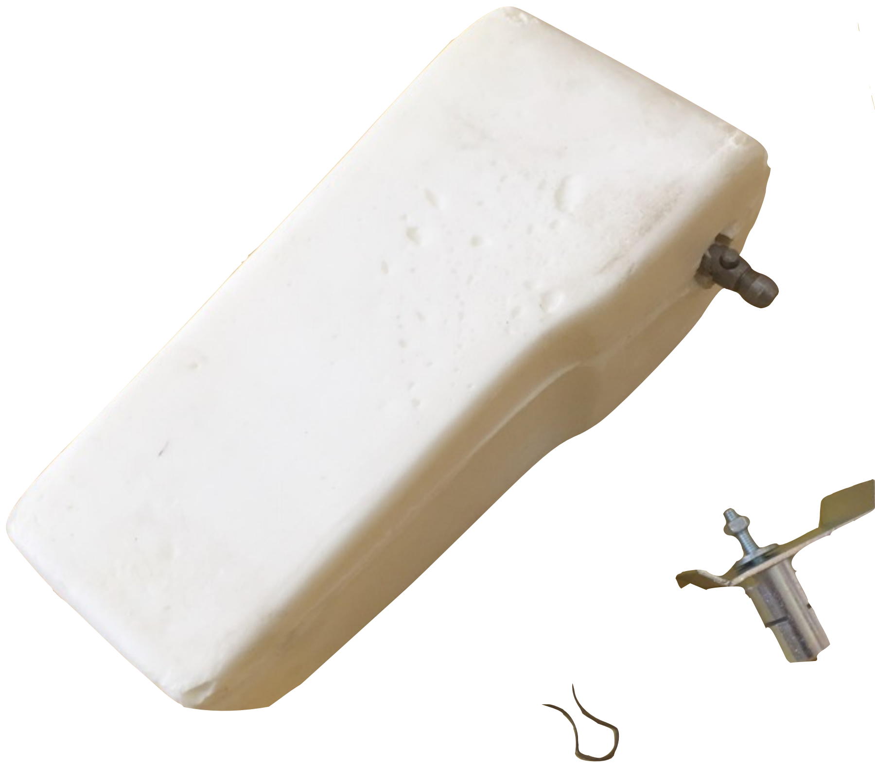
OB02 Wide Armrest Foam for Diver Seat