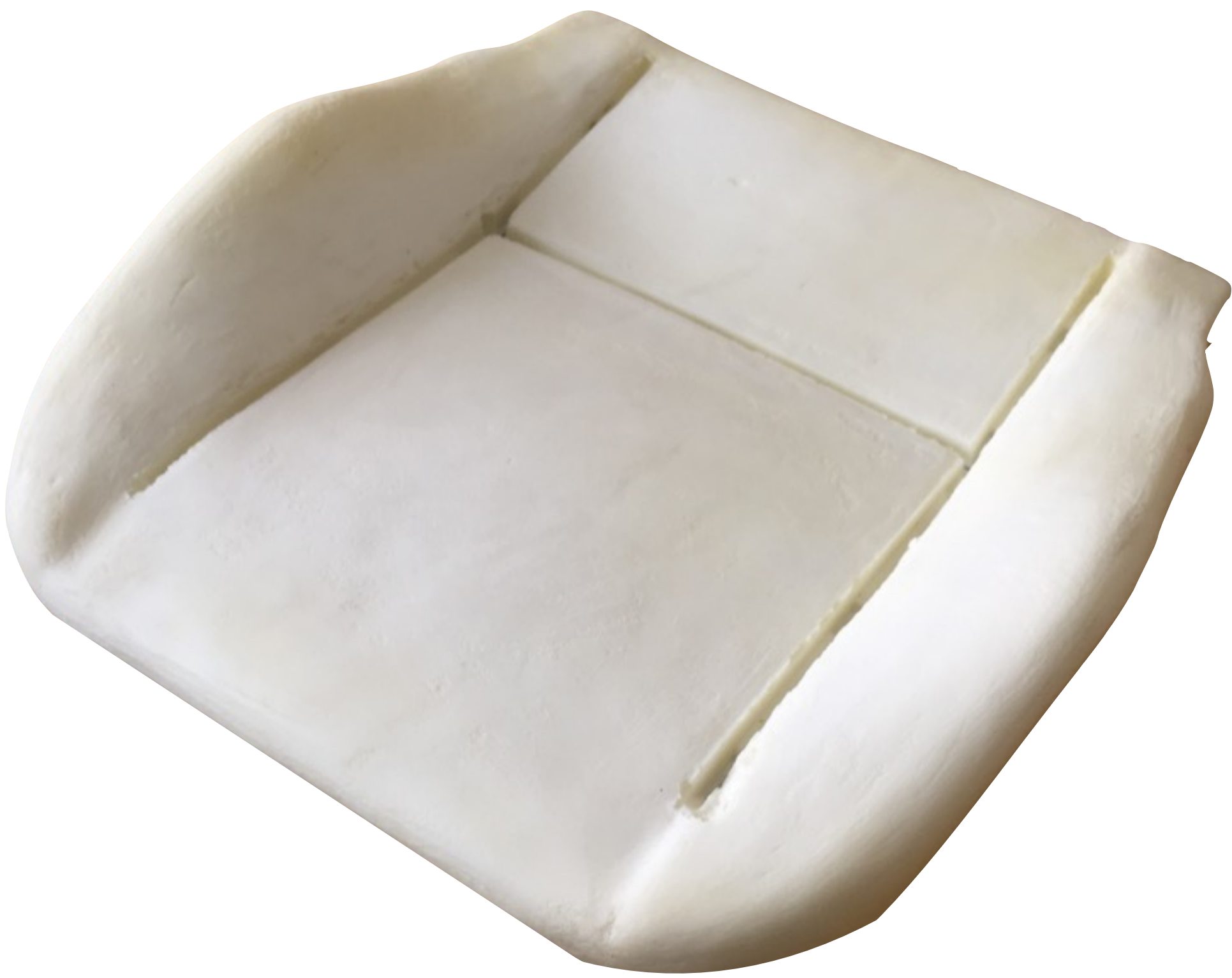
OB14 Replacement Bottom Foam for FIAT DOBLO (OLD BODY)