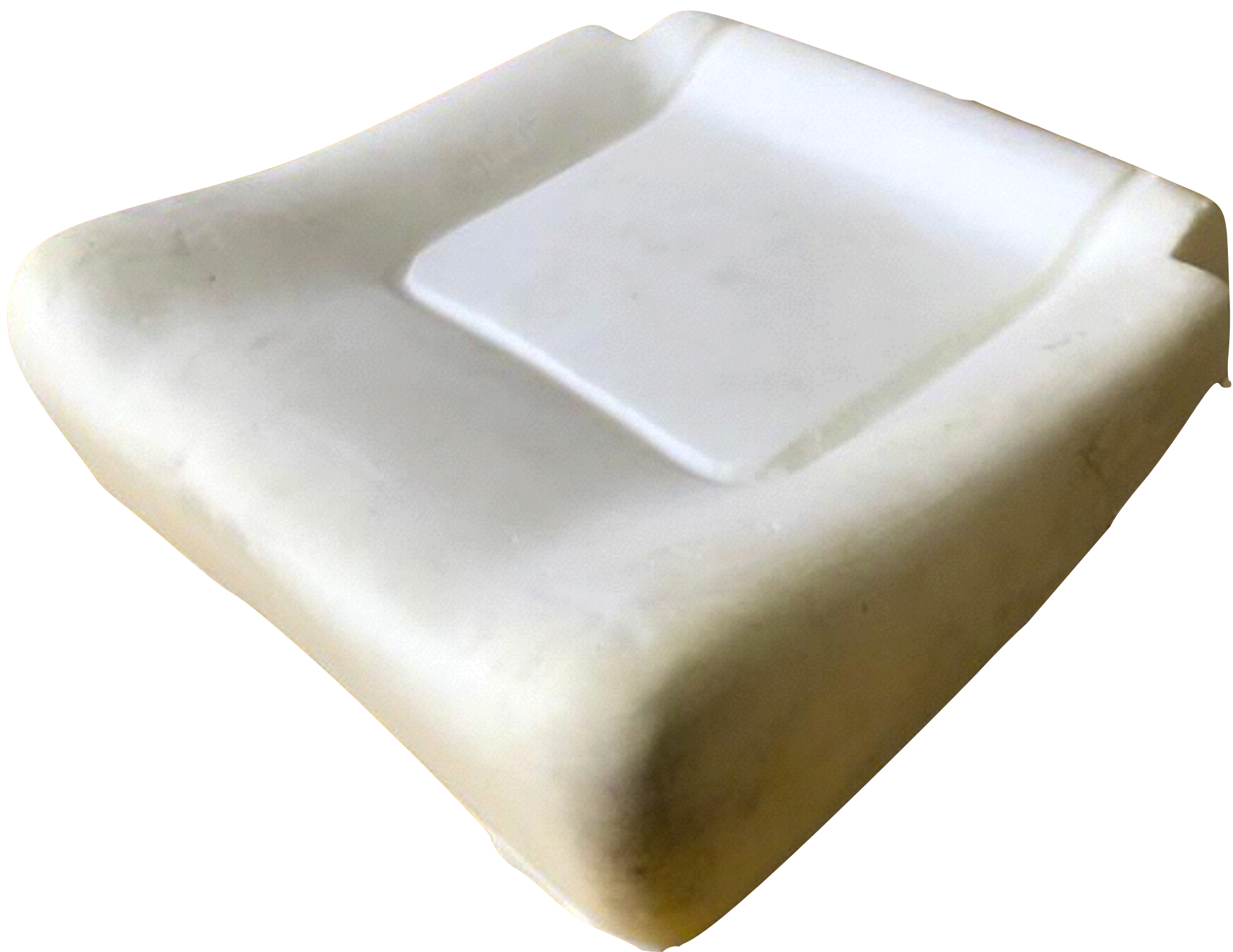
OB113 Replacement Bottom Foam for RENAULT MASTER