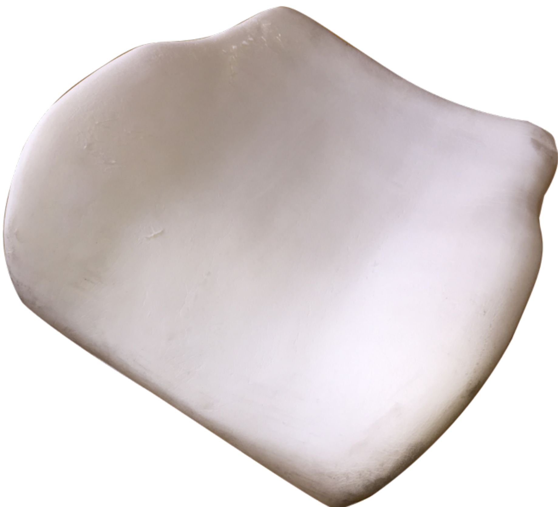
OB10 Replacement Low Backrest Foam