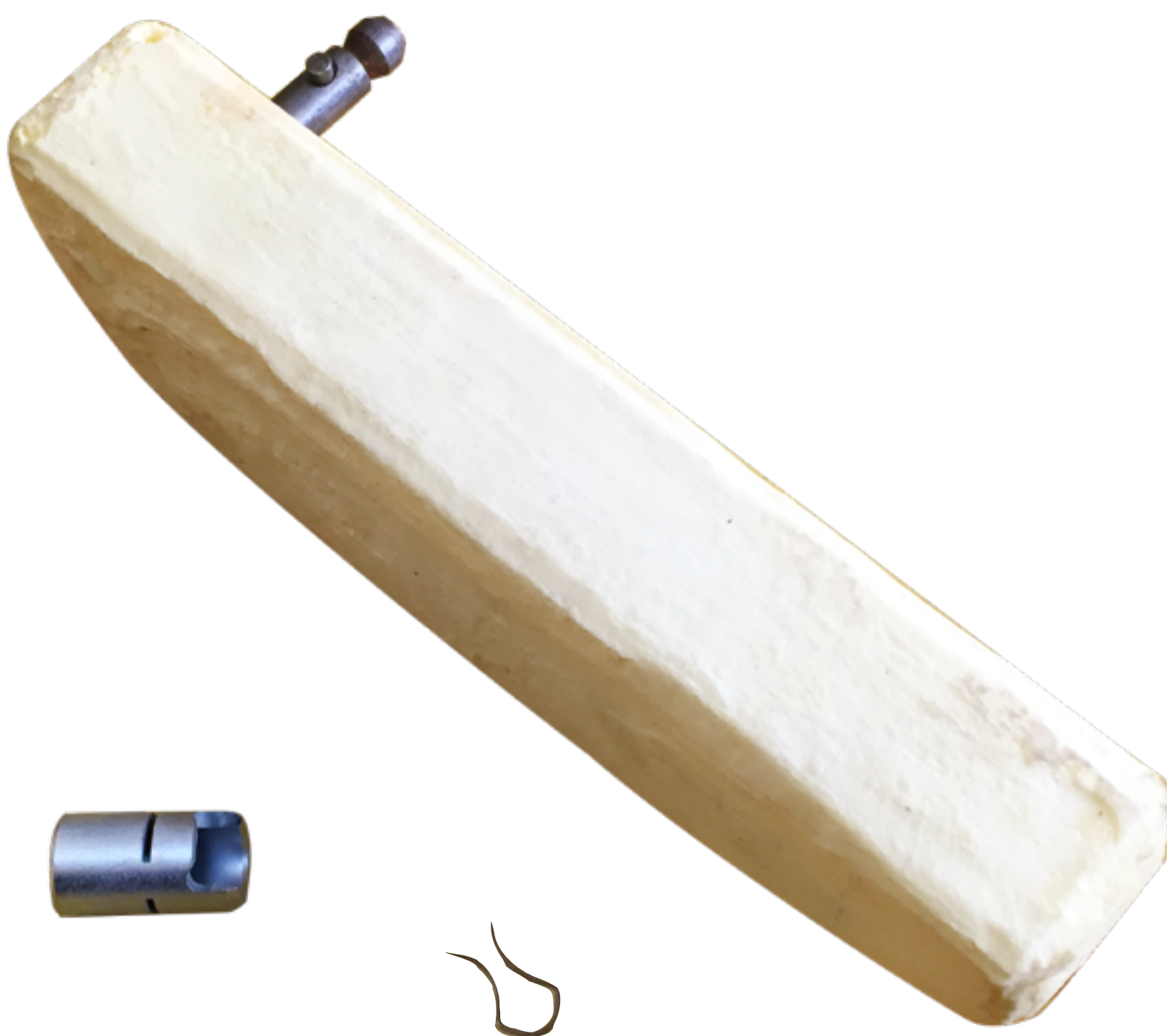
OB05 Thin Armrest Foam for Driver Seat