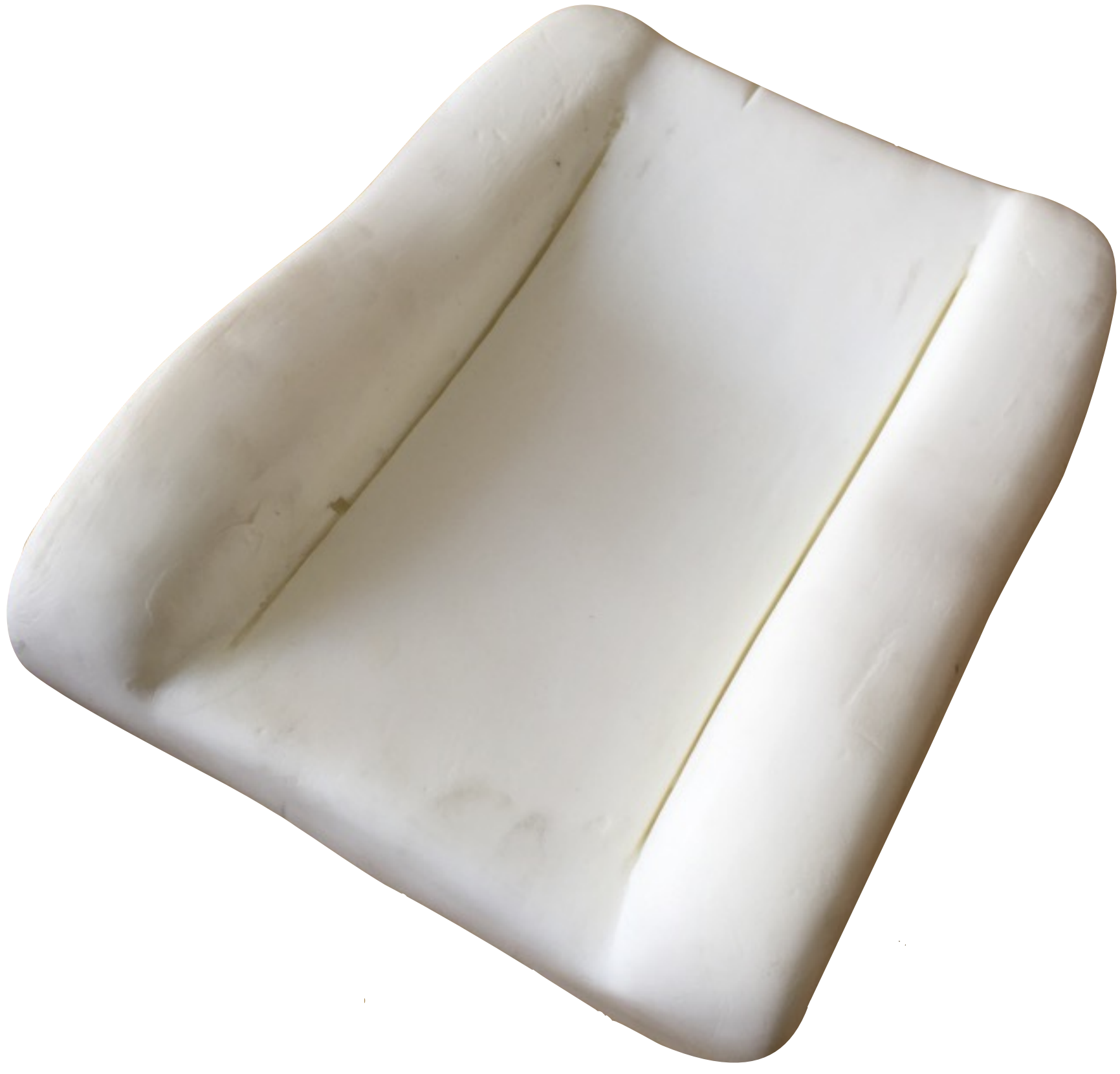
OB20 Replacement Backrest Foam for ŞAHİN