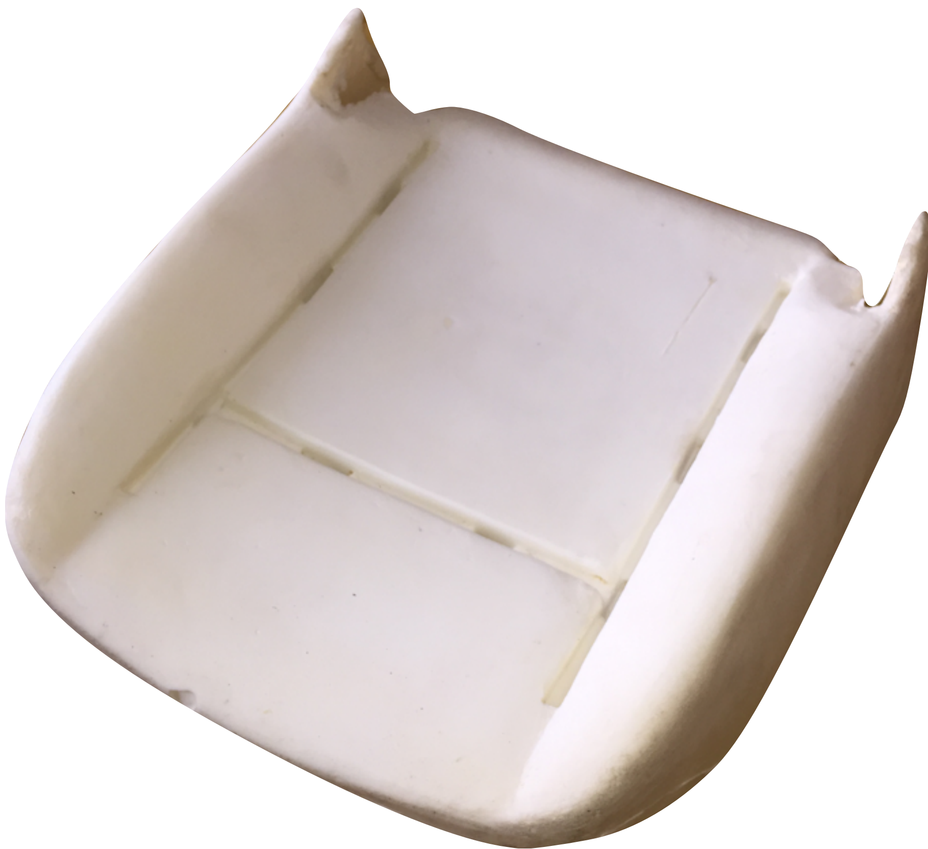
OB48 Replacement Bottom Foam for DACIA LOGAN